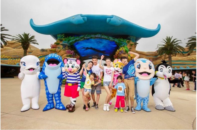
Zhuhai Hengqin Chimelong International Ocean Resort

Photo caption: Sands Resorts Cotai Strip Macao has launched new package which allows guests to combine a stay at The Venetian Macao or Holiday Inn Macao, Cotai Central with a night at Zhuhai Hengqin Chimelong International Ocean Resort.