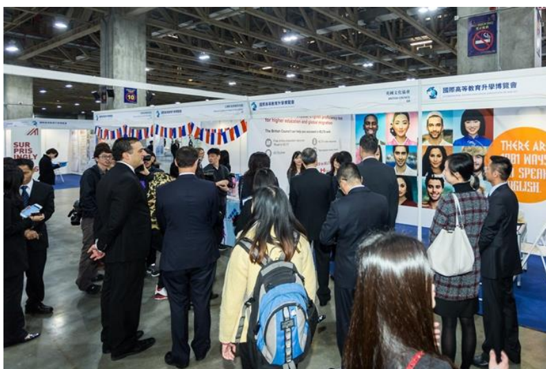
Photo caption: The International Higher Education Exposition of Macao kicked off at The Venetian® Macao Friday, March 13. The event runs until Sunday, March 15 at Cotai Expo Hall A and provides a platform for students, parents, and education professionals to explore education options locally and internationally.