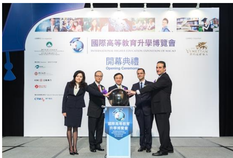
Photo caption: Officiating guests host the International Higher Education Exposition at the opening ceremony on Friday, March 13 at The Venetian Macao. The event runs until Sunday, March 15 at Cotai Expo Hall A and provides a platform for students, parents, and education professionals to explore education options locally and internationally.