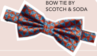
BOW TIE BY SCOTCH & SODA