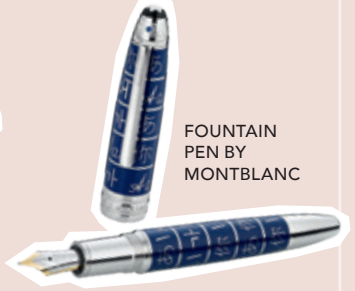
FOUNTAIN PEN BY MONTBLANC