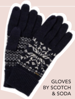
GLOVES BY SCOTCH & SODA