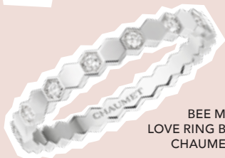
BEE MY LOVE RING BY CHAUMET

Party gear and perfect gifts for Christmas celebrations