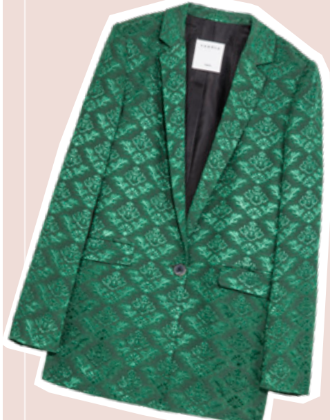
GREEN JACKET BY SANDRO