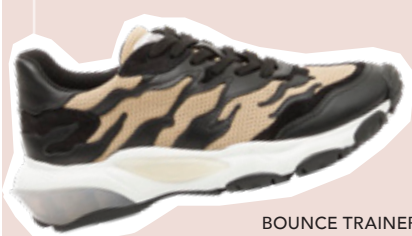
BOUNCE TRAINERS BY VALENTINO