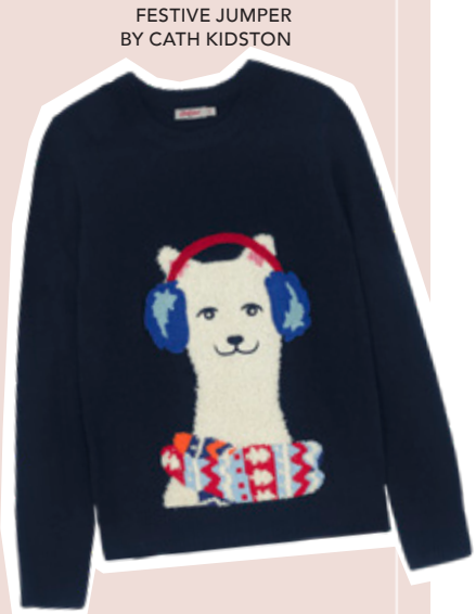
FESTIVE JUMPER BY CATH KIDSTON