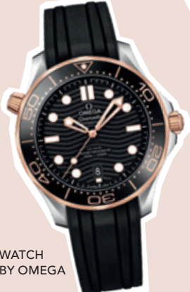
WATCH BY OMEGA