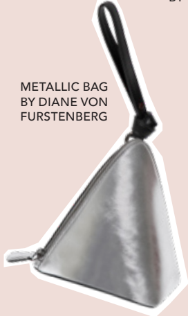
METALLIC BAG BY DIANE VON FURSTENBERG