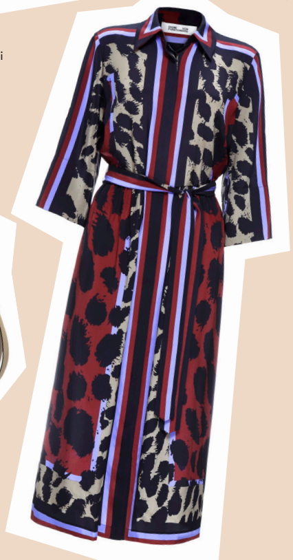
Dress by Diane von Furstenberg