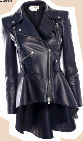
Jacket by Alexander McQueen