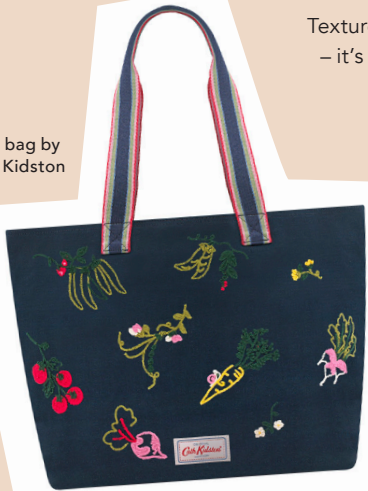
Tote bag by Cath Kidston