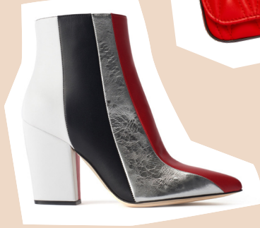
Boots by Sergio Rossi