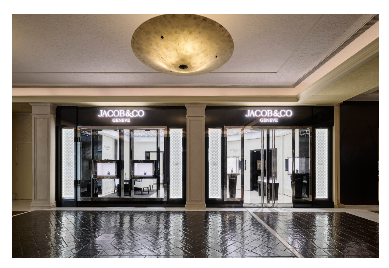
Click HERE to download the press kit

Macao, China, October, 2024 - JACOB & CO., the globally renowned luxury watch and jewelry brand, in partnership with Cortina Watch, is thrilled to announce the opening of its first boutique in Macao, located at the Venetian Macao. This inauguration signifies Cortina Watch's introduction of JACOB & CO. to North Asia, marking a significant expansion that underscores JACOB & CO.'s dedication to strengthening its presence in the Asian market. The boutique features a curated selection of JACOB & CO.'s most iconic and technically advanced timepieces, showcasing horological complications of exceptional innovation. This collaboration presents a distinctive opportunity for collectors and enthusiasts to discover masterpieces that push the boundaries of watchmaking.