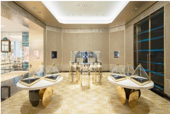
Tiffany & Co. Flagship Store at Four Seasons Macao