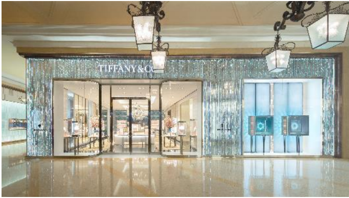
Tiffany & Co. Flagship Store at Four Seasons Macao