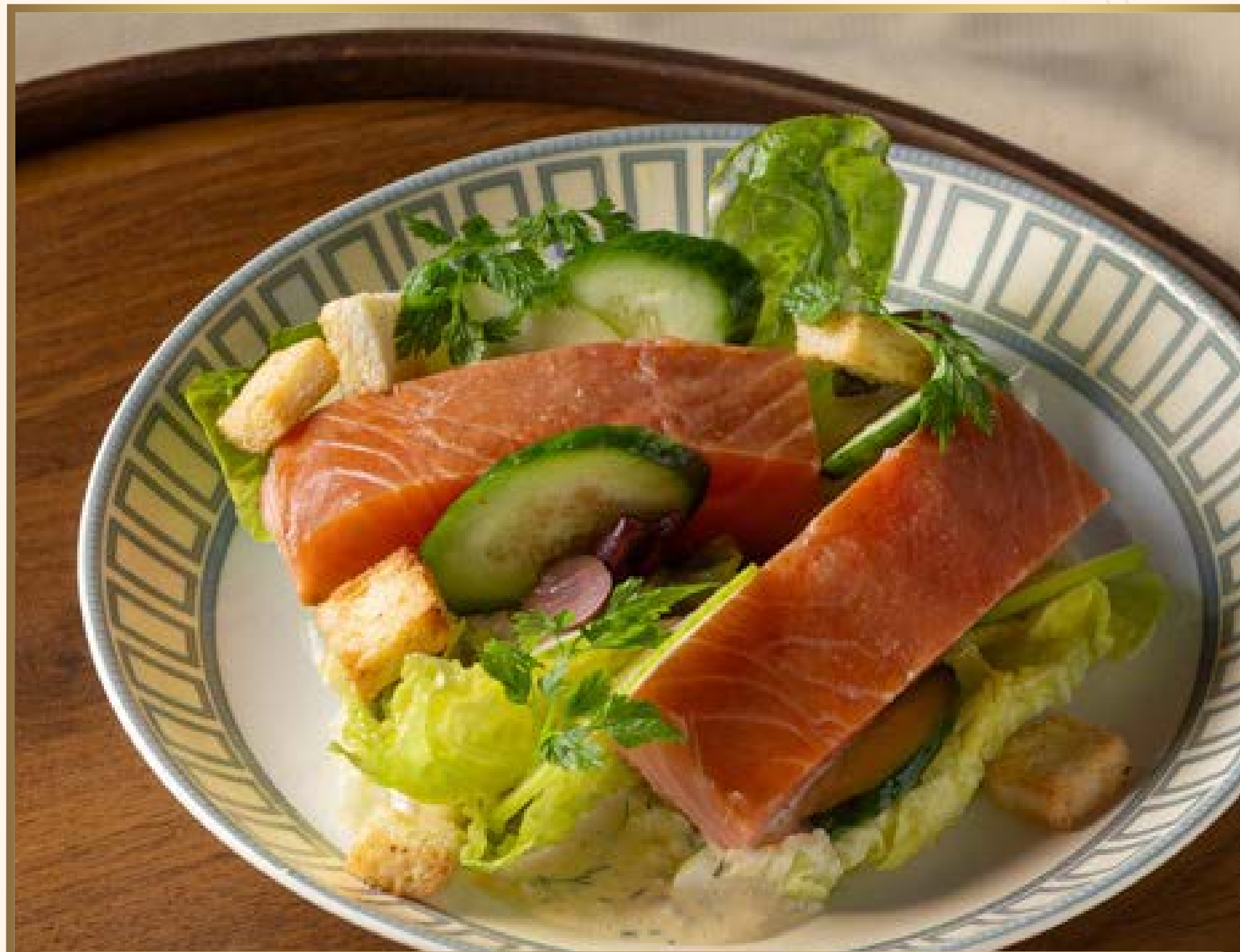
热熏鲑鱼嫩生菜沙拉配青苹果、 茴香和格里比什酱 HOT SMOKED SALMON AND BABY GEM LETTUCE SALAD WITH GRANNY SMITH APPLE, FENNEL, SAUCE GRIBICHE 88