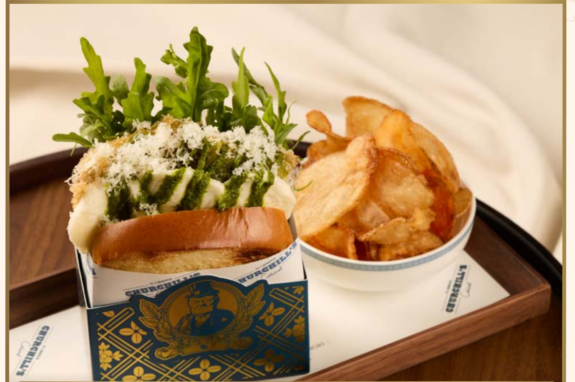
米兰茄子三明治 EGGPLANT MILANESE

帕玛森干酪酱汁，山核桃，嫩生菜，面包黄油腌菜，鸡肉汁 Parmesan dressing, pecan nut, baby gem lettuce, bread and butter pickle, chicken gravy