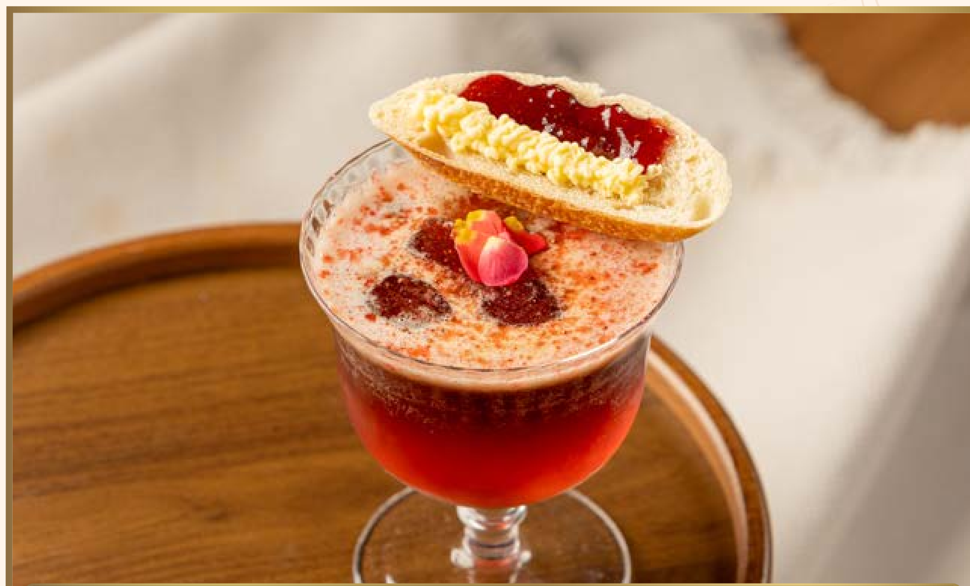
全日早餐 ALL DAY BREAKFAST