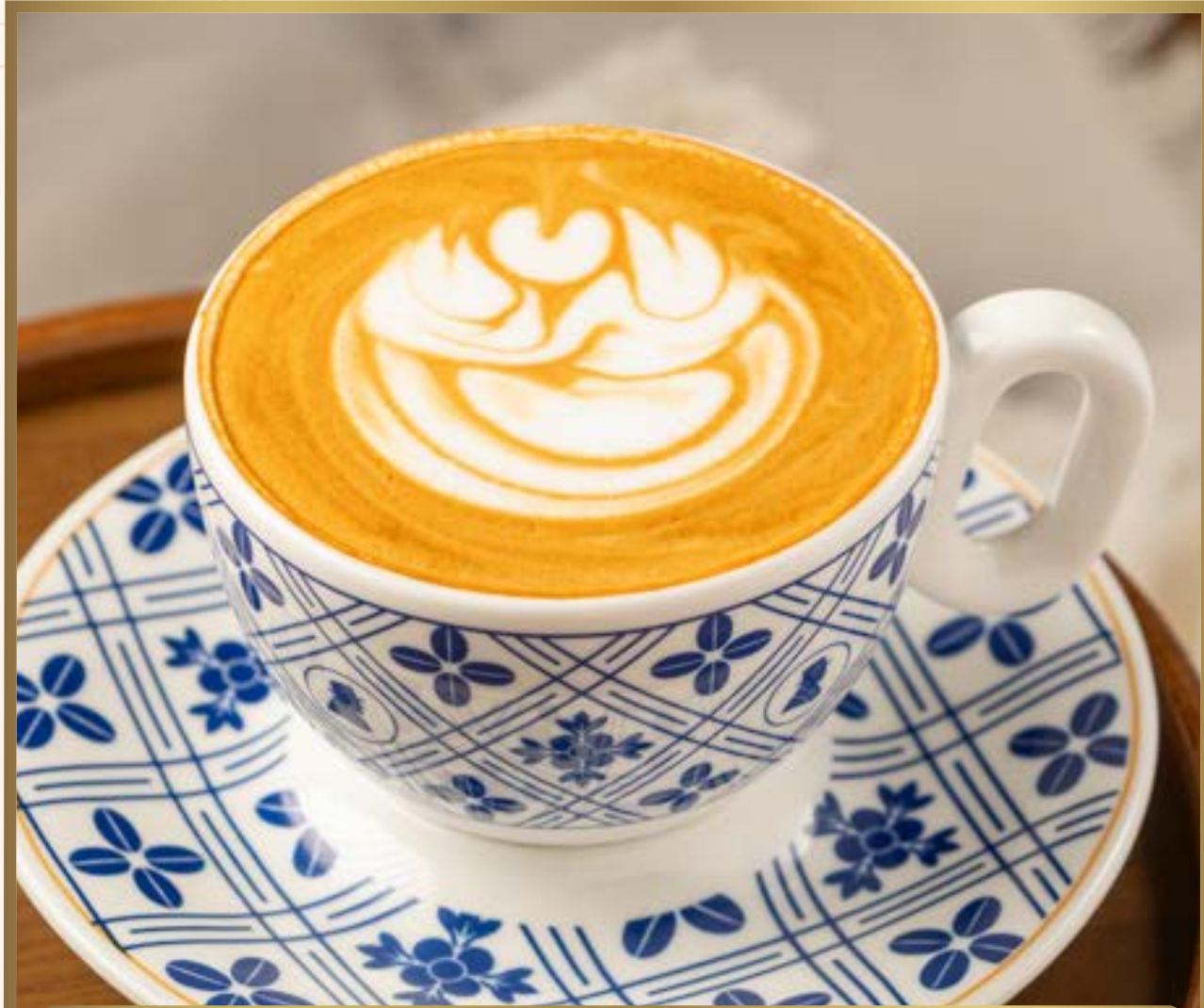
鸳鸯 YUEN YEUNG