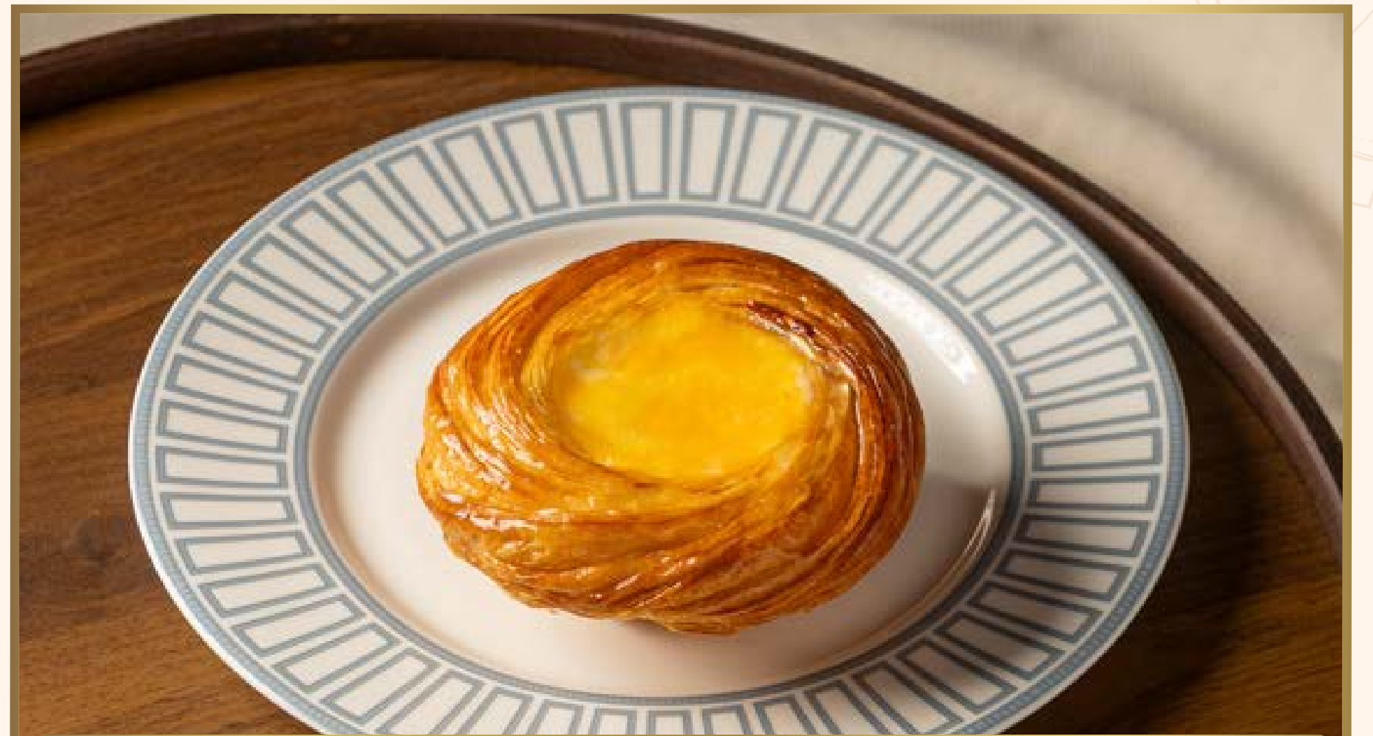
熔岩芝士蛋糕丹麦酥 LAVA CHEESECAKE DANISH