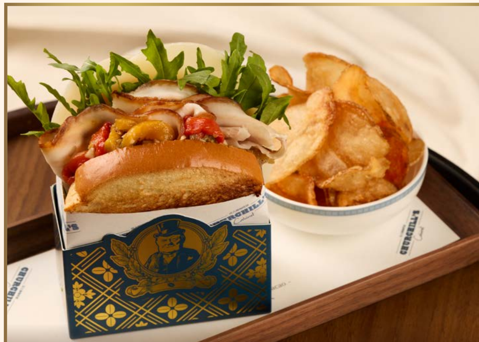
烤猪腩肉三明治 PORCHETTA PORCHETTA

酥脆茄子，手工马苏里拉奶酪，芝麻菜，圣马扎诺番茄酱，罗勒青酱 Crispy eggplant, handmade mozzarella, rocket, San Marzano tomato sauce, pesto