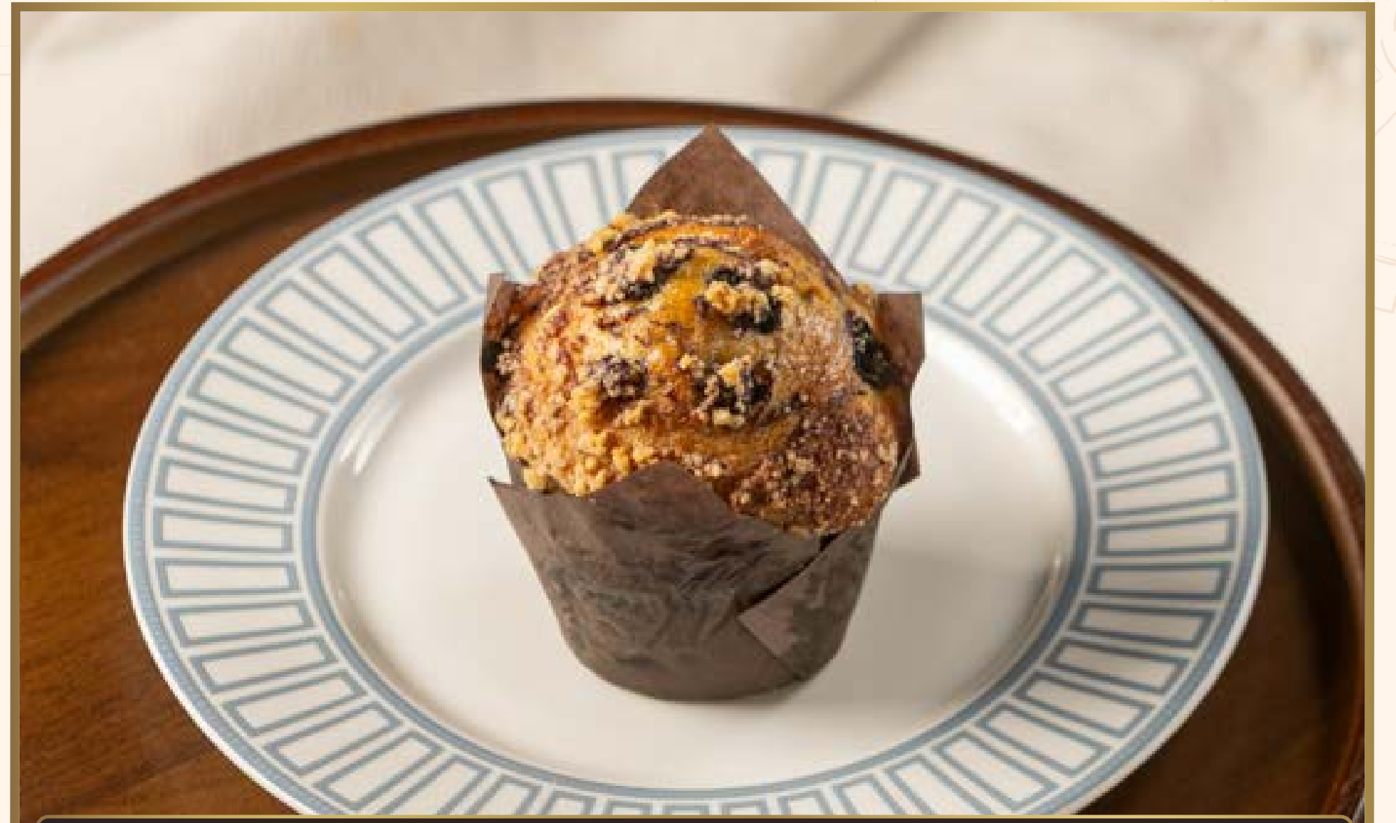
蓝莓麦芬 BLUEBERRY MUFFIN