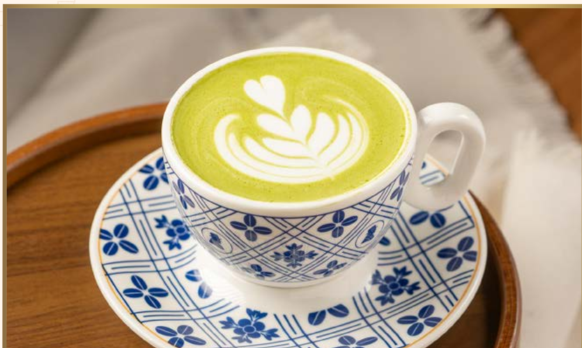
抹茶拿铁 MATCHA LATTE