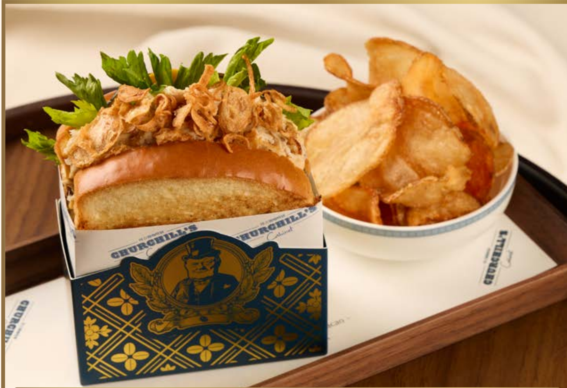
烤鸡肉三明治 PULLED CHICKEN

我们所有的三明治都是用烤布里欧修并搭配自制薯片 All our sandwiches are made with toasted brioche and served with homemade chips