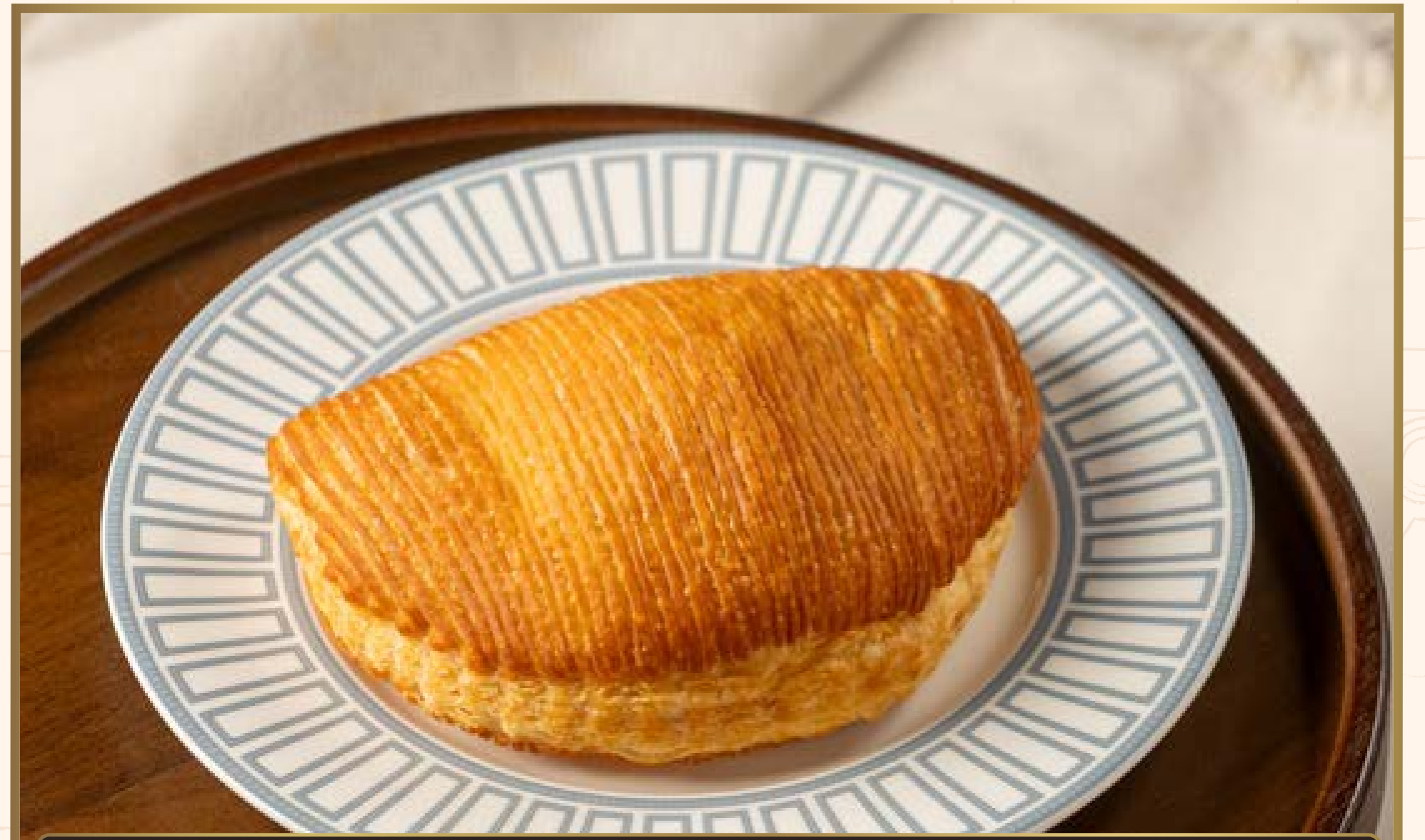
苹果贝壳酥 APPLE TURNOVER