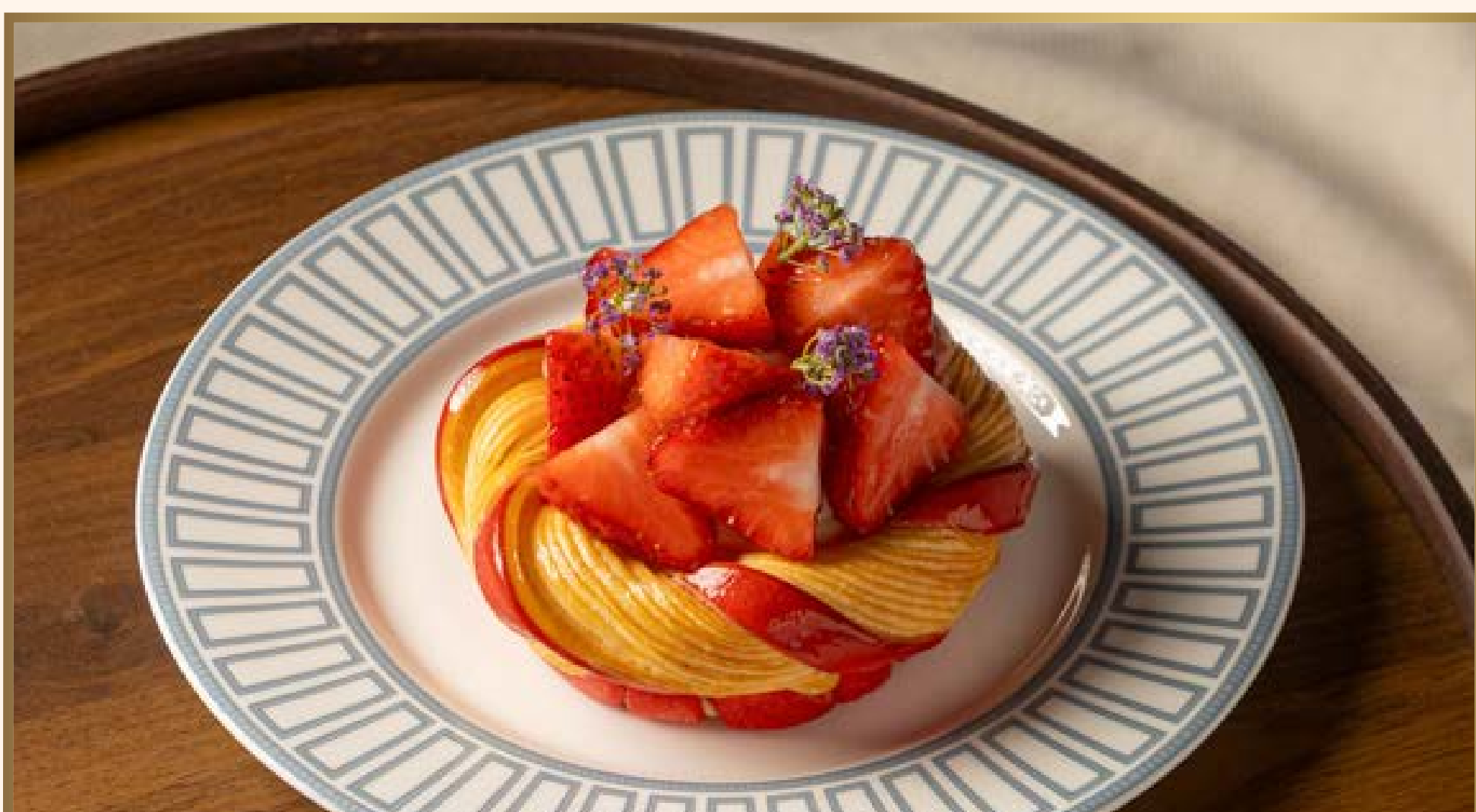
草莓酥饼丹麦酥 STRAWBERRY SHORTCAKE DANISH