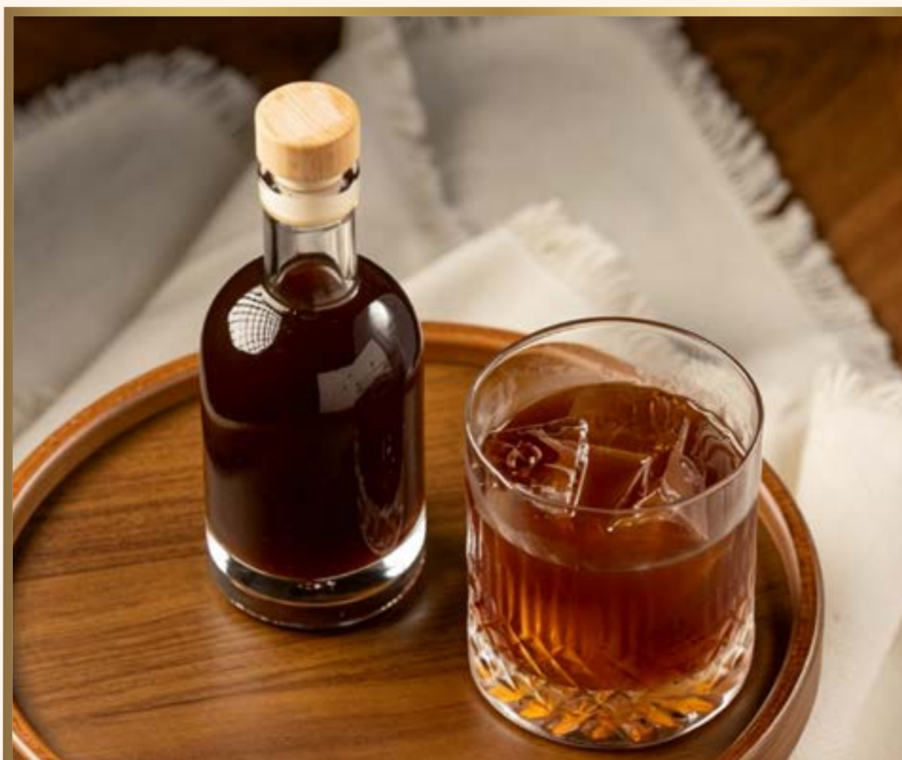
冷萃咖啡 COLD BREW