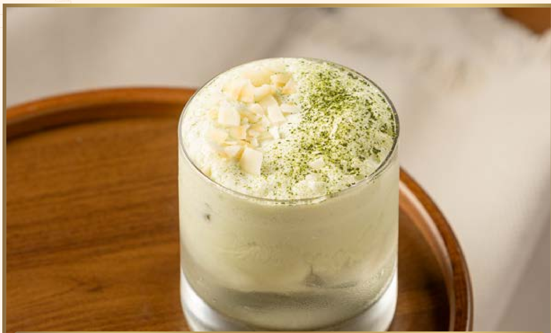
椰抹浮云 MISTY COCO MATCHA