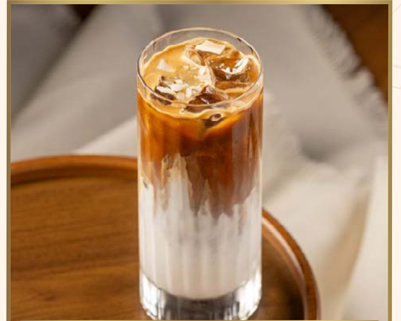
生椰拿铁 RAW COCONUT CAFÉ LATTE