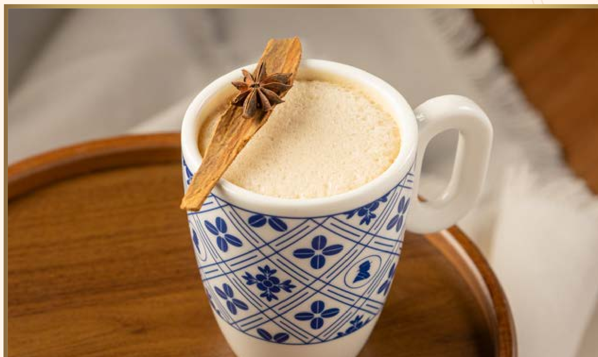
香料拿铁 CHAI LATTE