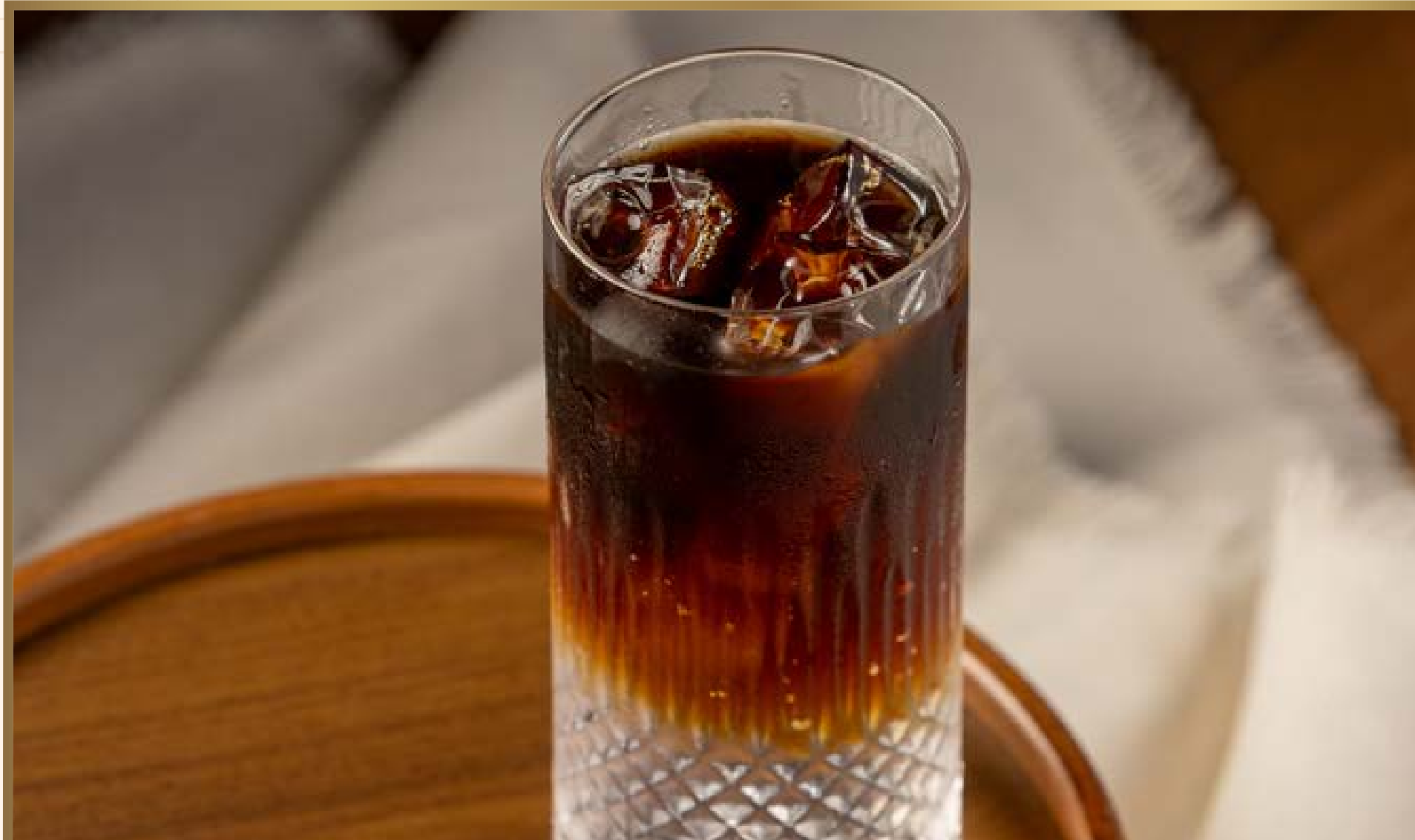
气泡冰滴咖啡 SPARKLING ICE DRIP