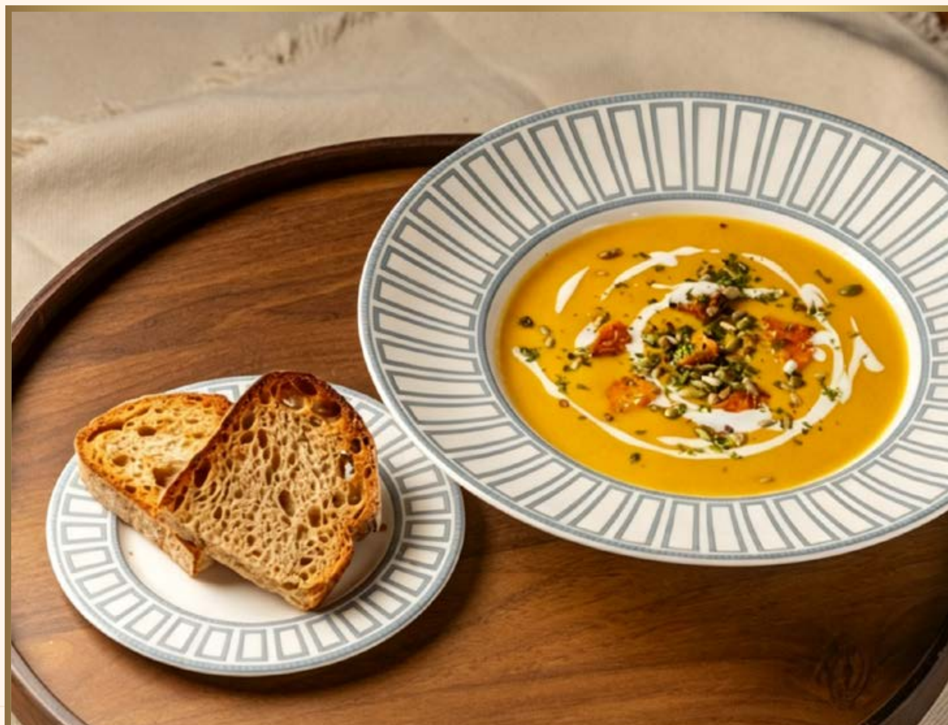
香料南瓜汤：蜂蜜烤南瓜、烤谷物、 椰子奶油、面包丁 SPICED KABOCHA PUMPKIN SOUP: HONEY ROASTED PUMPKIN, TOASTED GRAINS, COCONUT COULIS, CROUTONS 68

所有价格以澳门元计算, 并须另加10%服务费 All price are in MOP and subject to 10% service charge