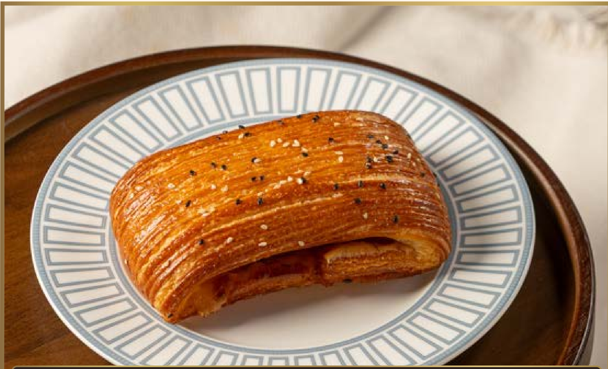
火腿芝士牛角包 HAM AND CHEESE CROISSANT