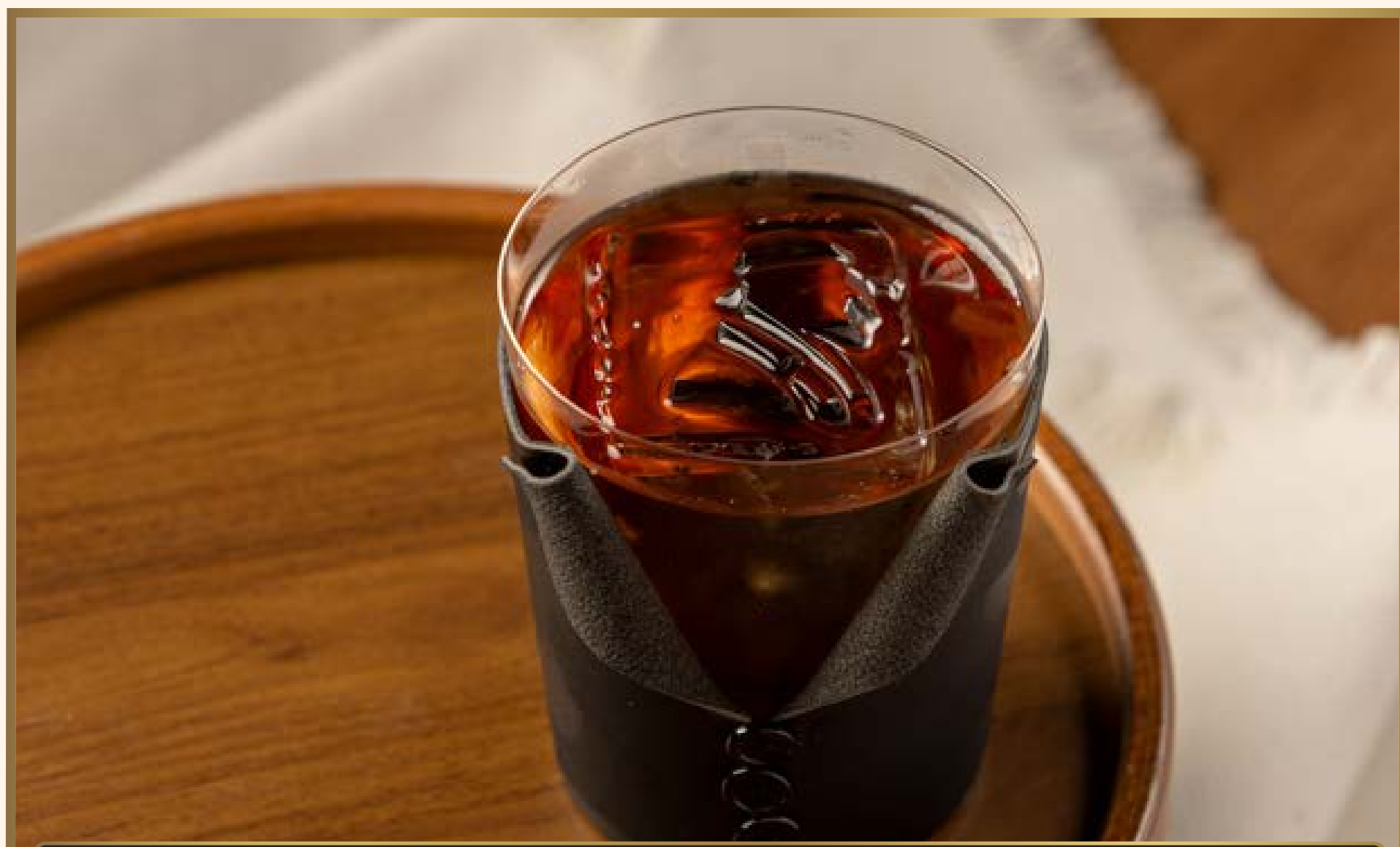
琥珀余温 AMBER EMBER