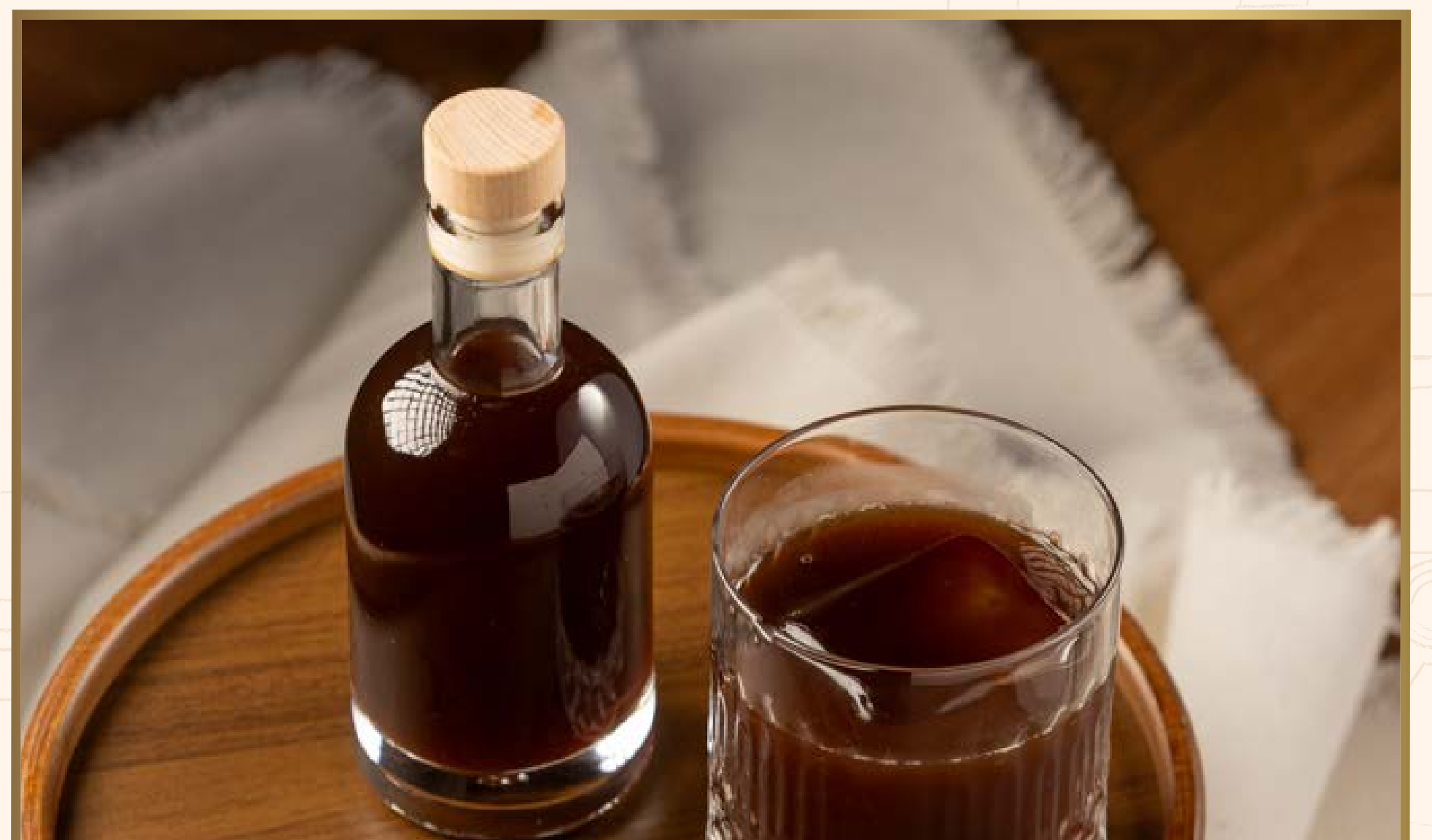
冰滴咖啡 ICE DRIP