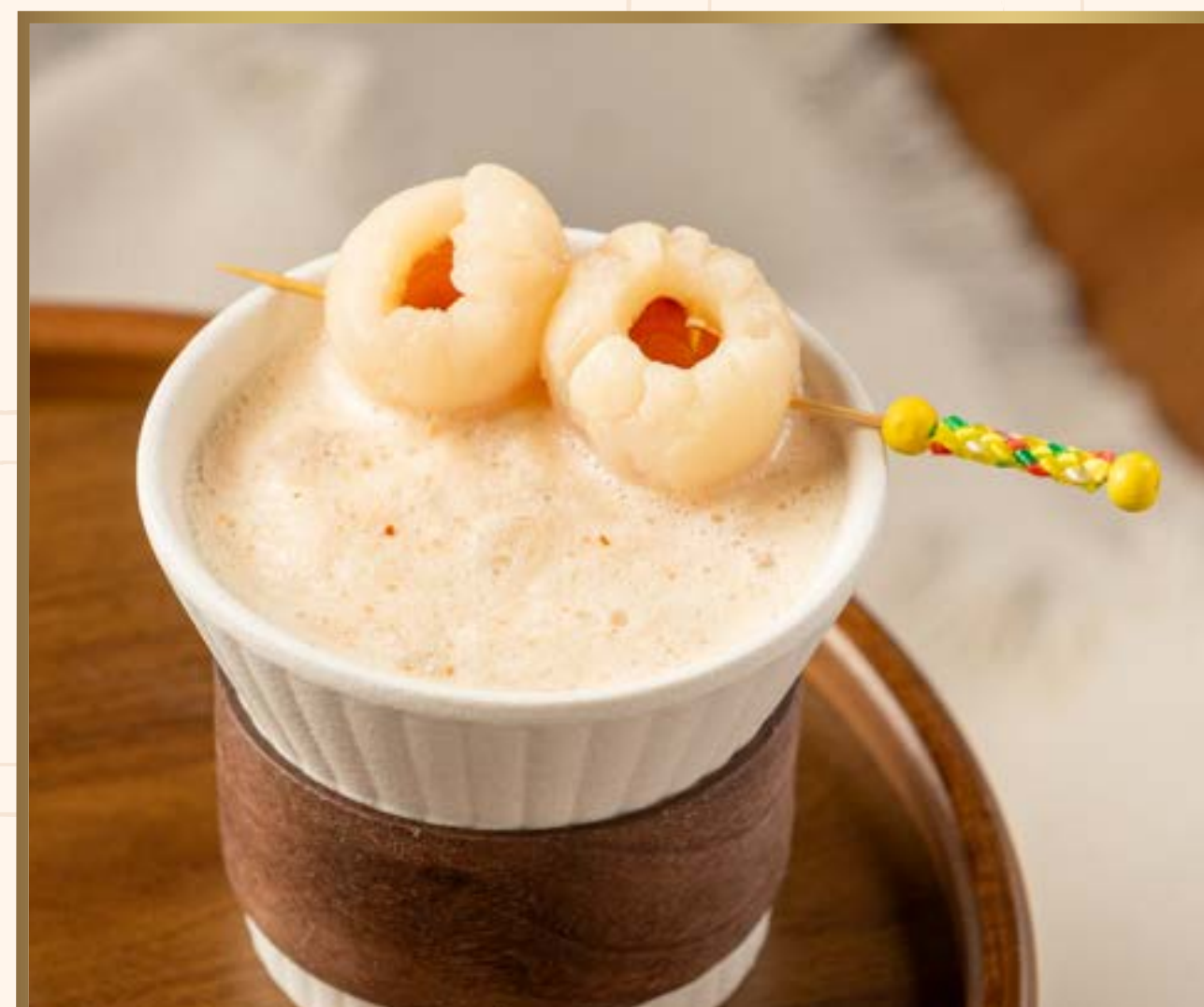
荔枝乳酸冰茶 LYCHEE YOIC ICE TEA