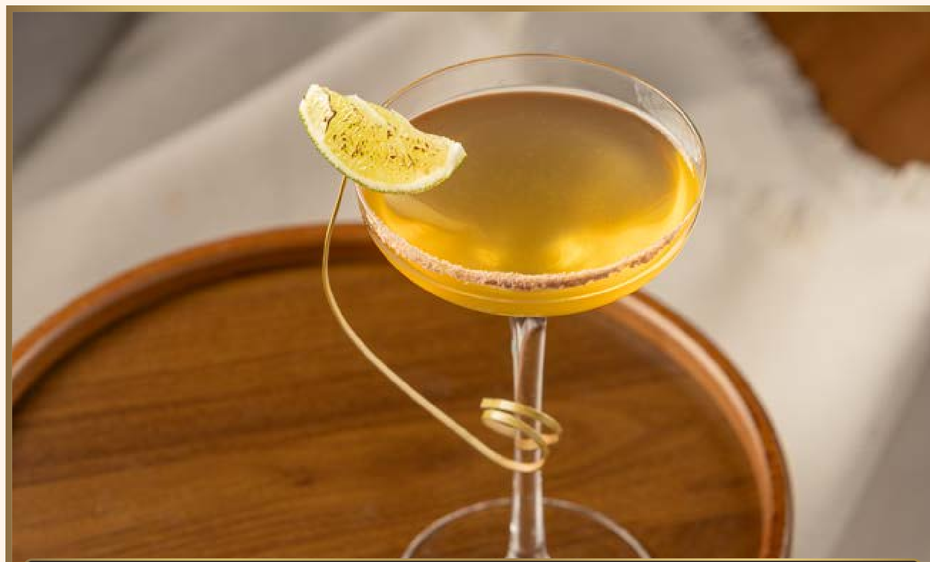
灰烬时分 ASHEN HOUR