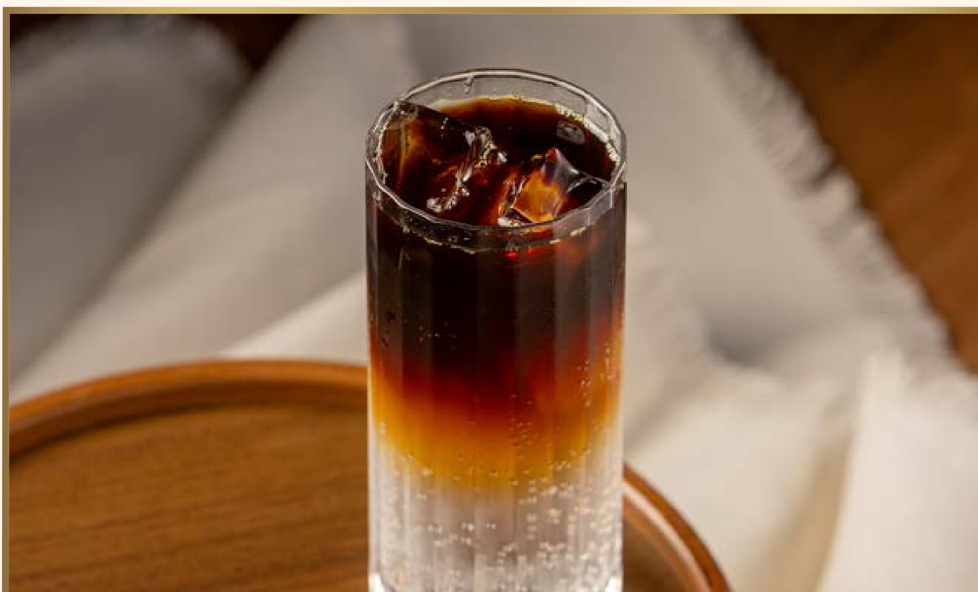
气泡冷萃咖啡 SPARKLING COLD BREW