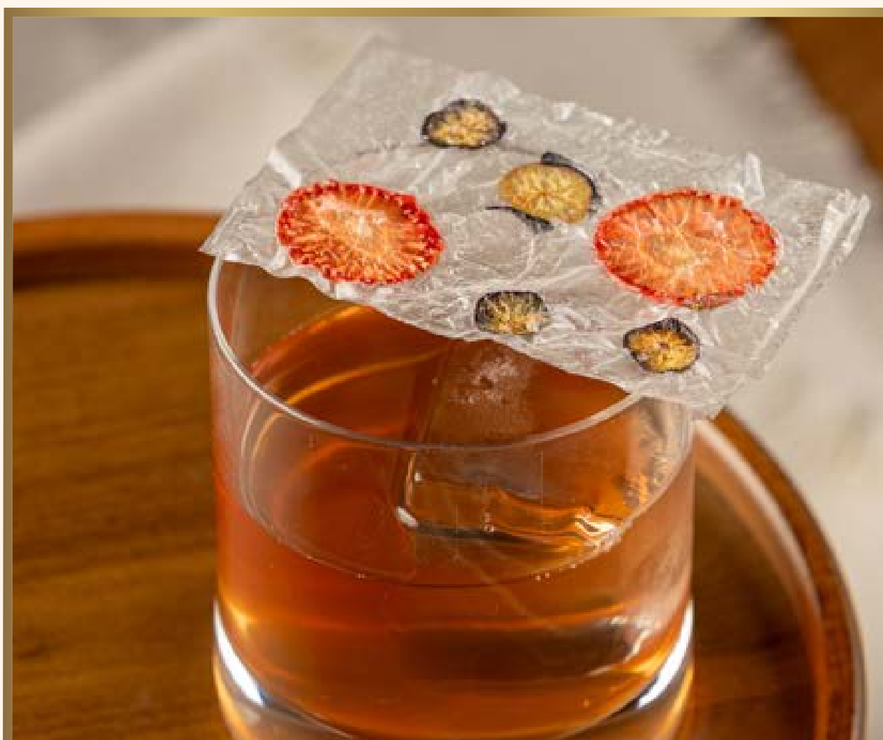
莓果乐园 BERRY FIELDS