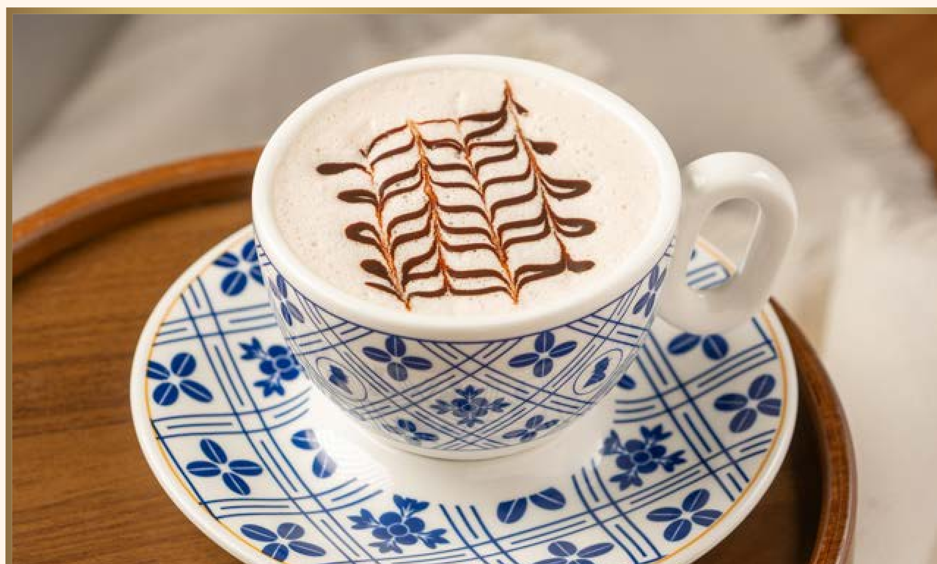
丘吉尔的巧克力牛奶 CHURCHILL'S TABLE CHOCOLATE MILK