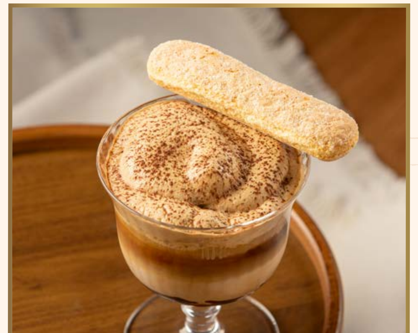
提拉米苏拿铁 TIRAMISU LATTE