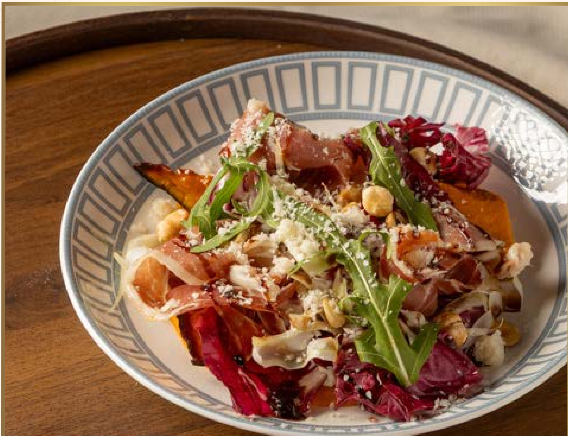
帕尔玛火腿沙拉配自制乳清干酪、 烤南瓜、红菊苣、榛子、陈年香醋 PARMAHAM SALAD WITH HOUSE MADE RICOTTA, ROASTED SQUASH, RADICCHIO, HAZELNUT, AGED BALSAMIC 88