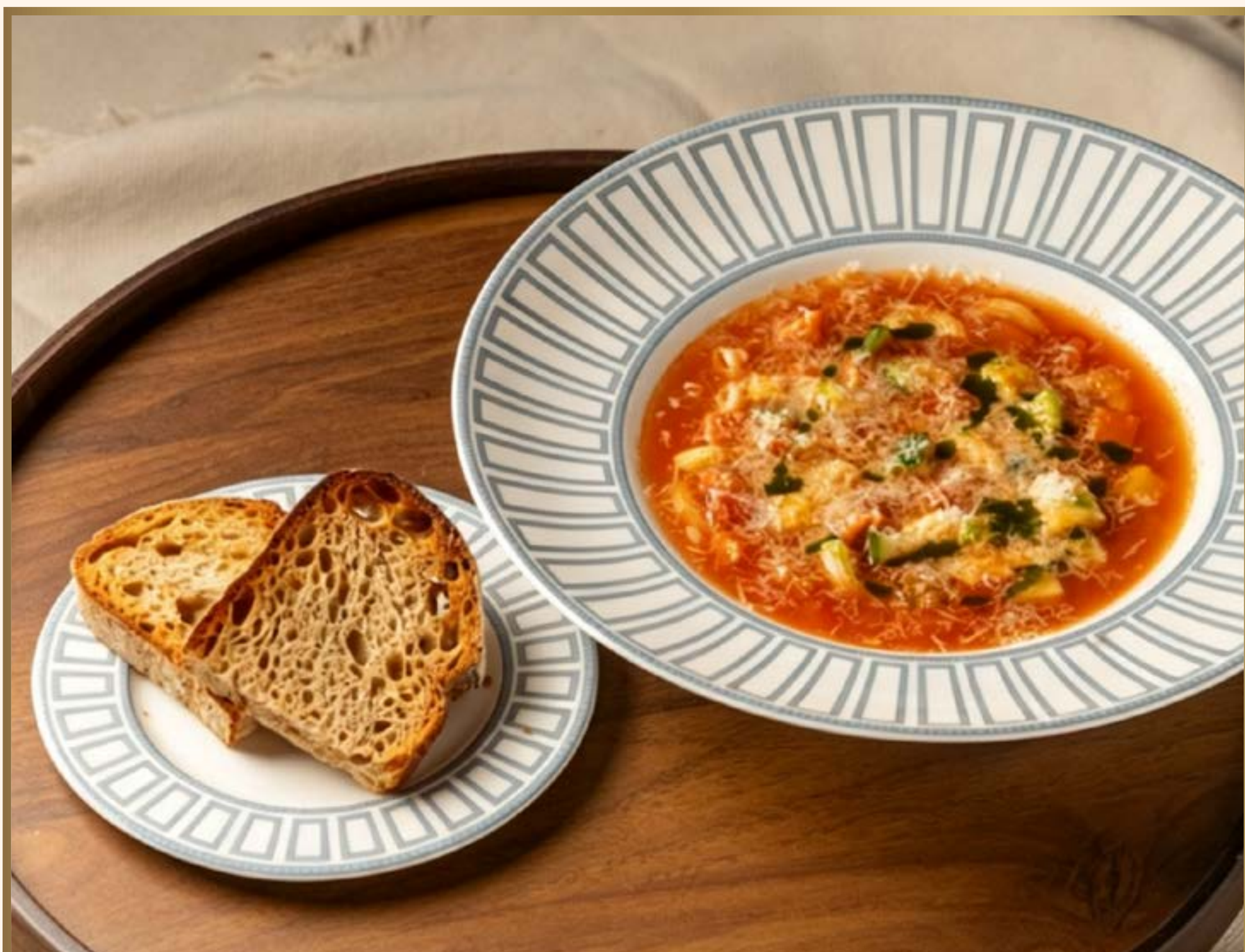
乡村风味蔬菜通心粉汤： 陈年帕玛森干酪、罗勒青酱、烤酸面包 COUNTRYSTYLE MINESTRONE: AGED PARMESAN, PESTO, TOASTED SOURDOUGH 68