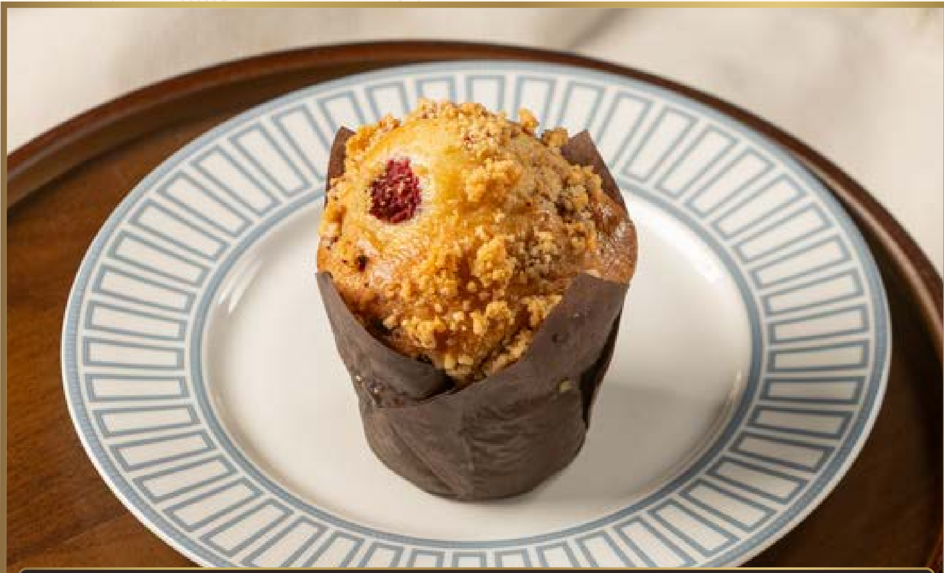
覆盆子麦芬 RASPBERRY MUFFIN