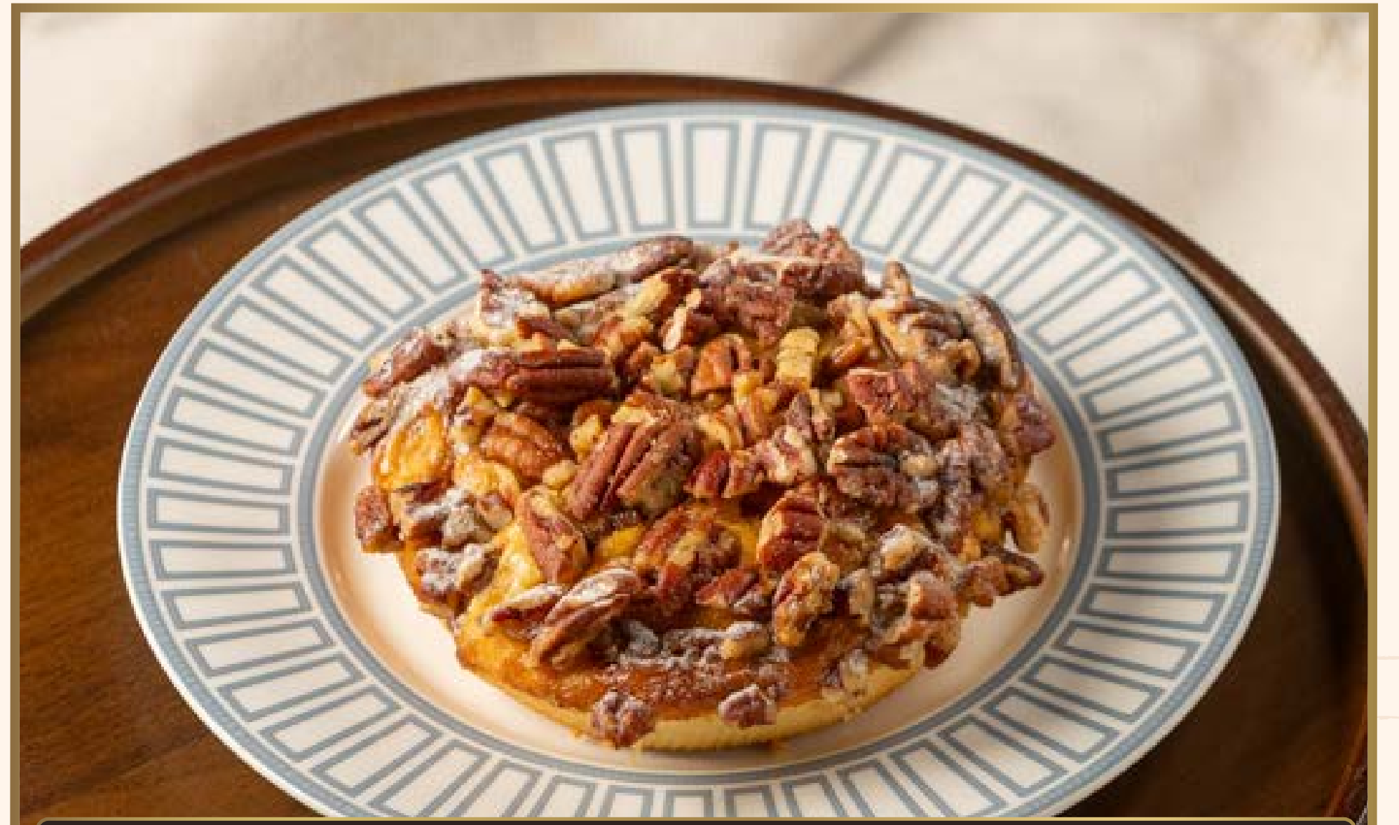
肉桂胡桃卷 CINNAMON AND PECAN ROLL