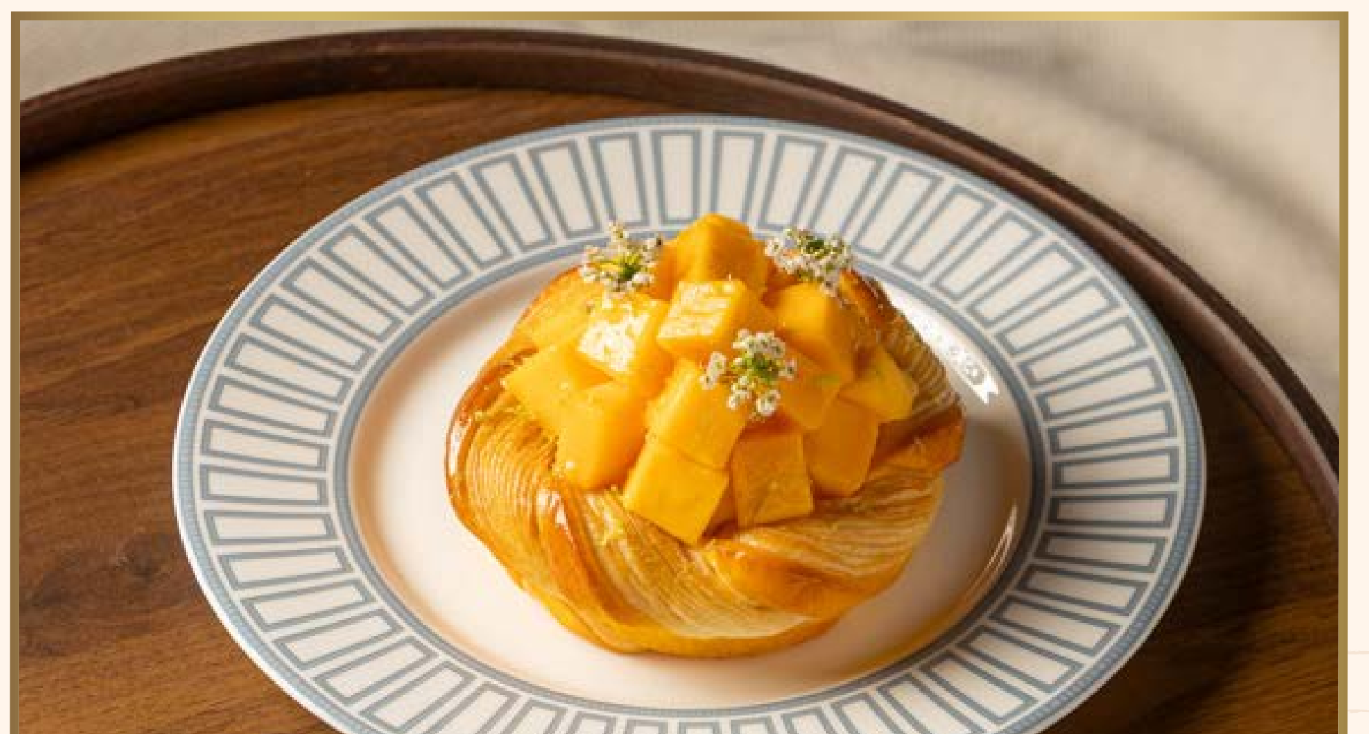
芒果、青柠和椰子丹麦酥 MANGO, LIME & COCONUT DANISH