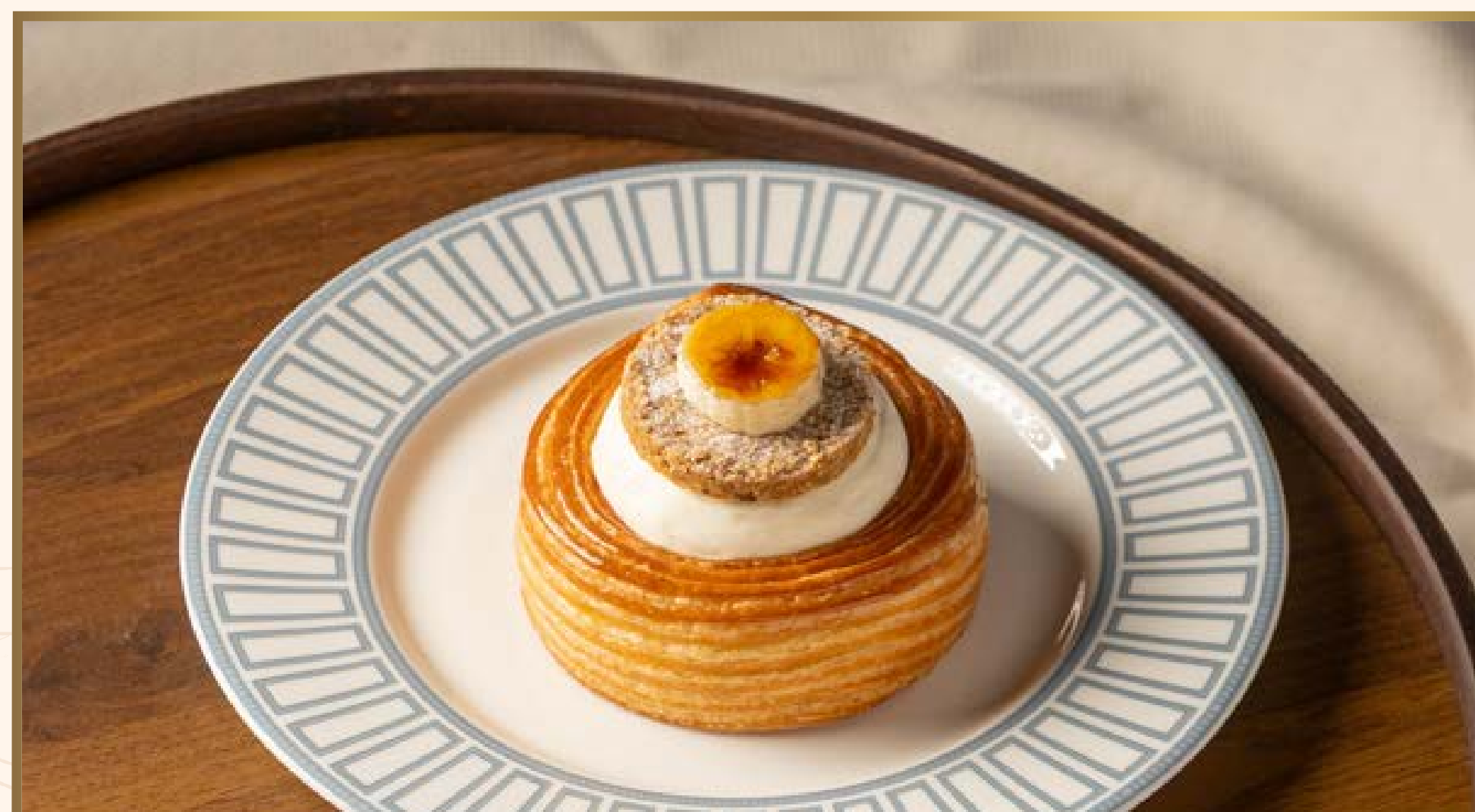
香蕉太妃丹麦酥 BANOFFEE DANISH