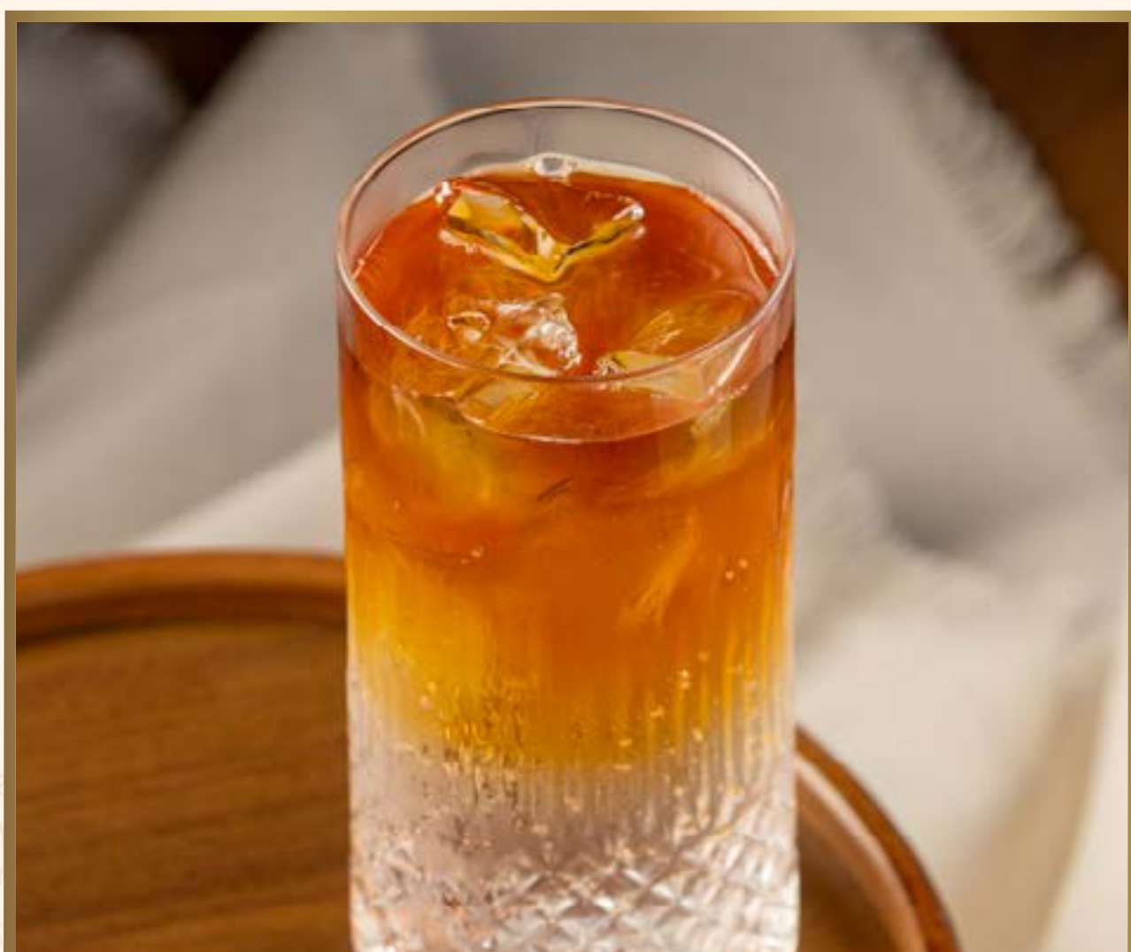
苏打冷泡冰茶 COLD BREW TEA SODA