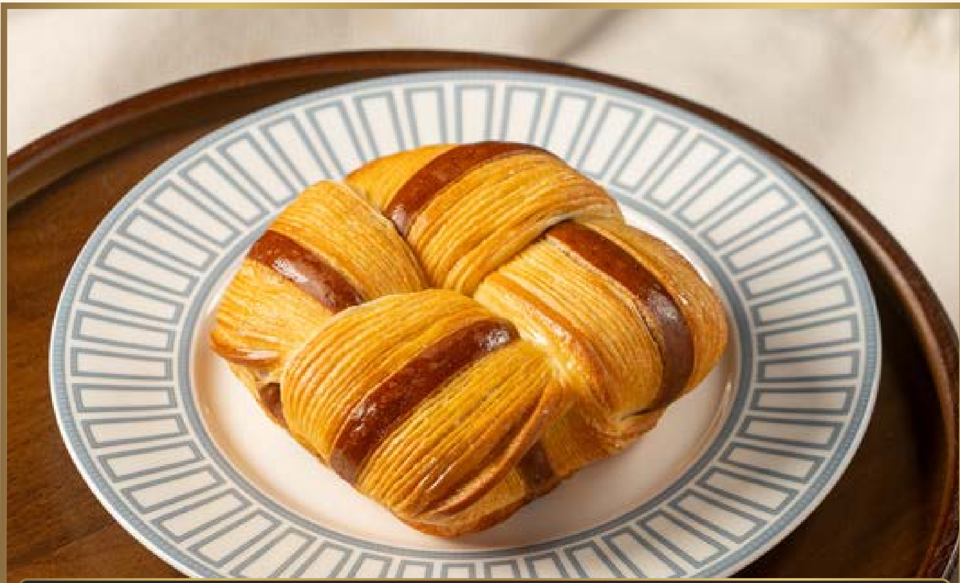
榛子巧克力酥 HAZELNUT CHOCOLATE BOX