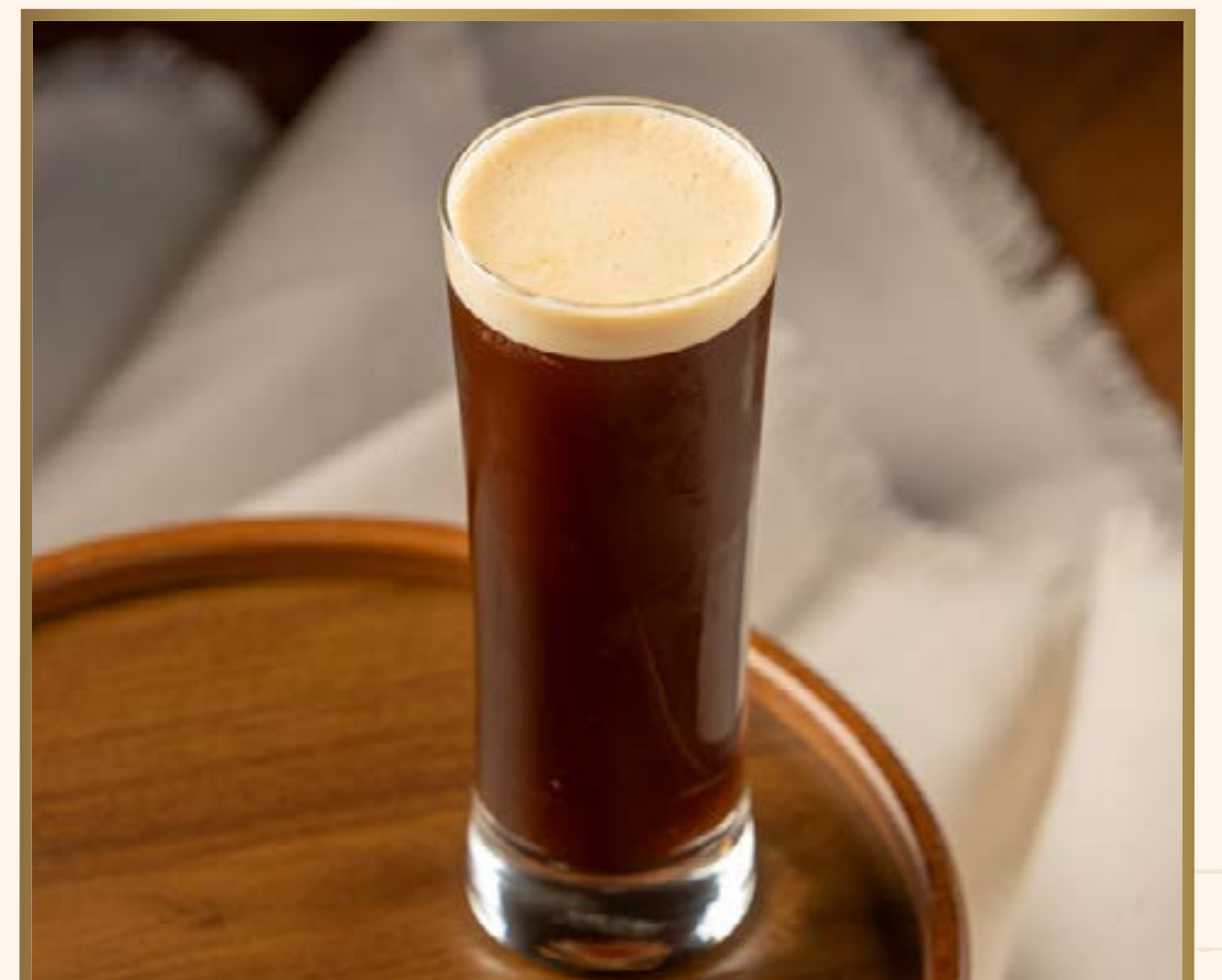
氮气冷萃咖啡 NITRO COLD BREW