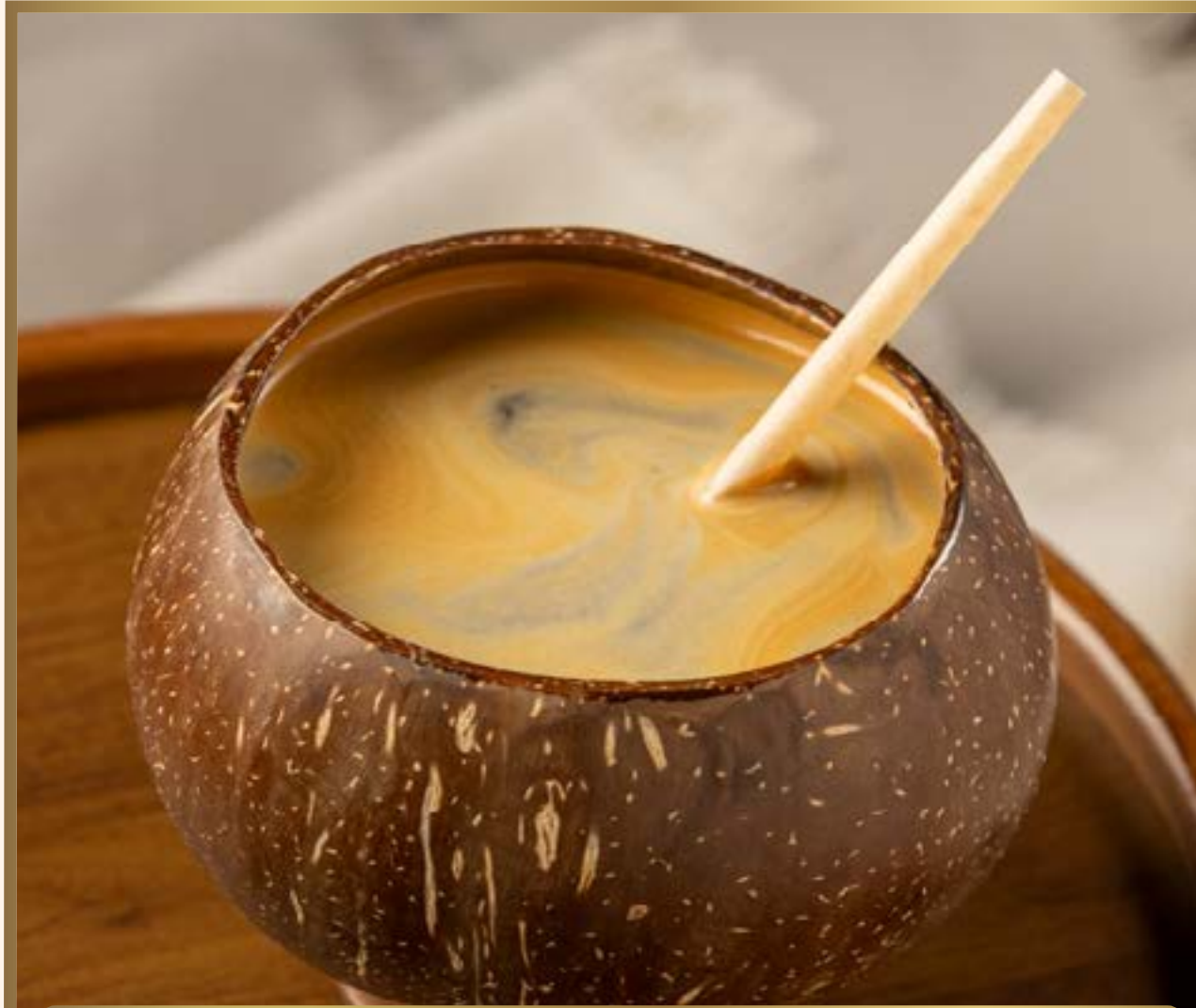
椰青美式 COCONUT WATER AMERICANO