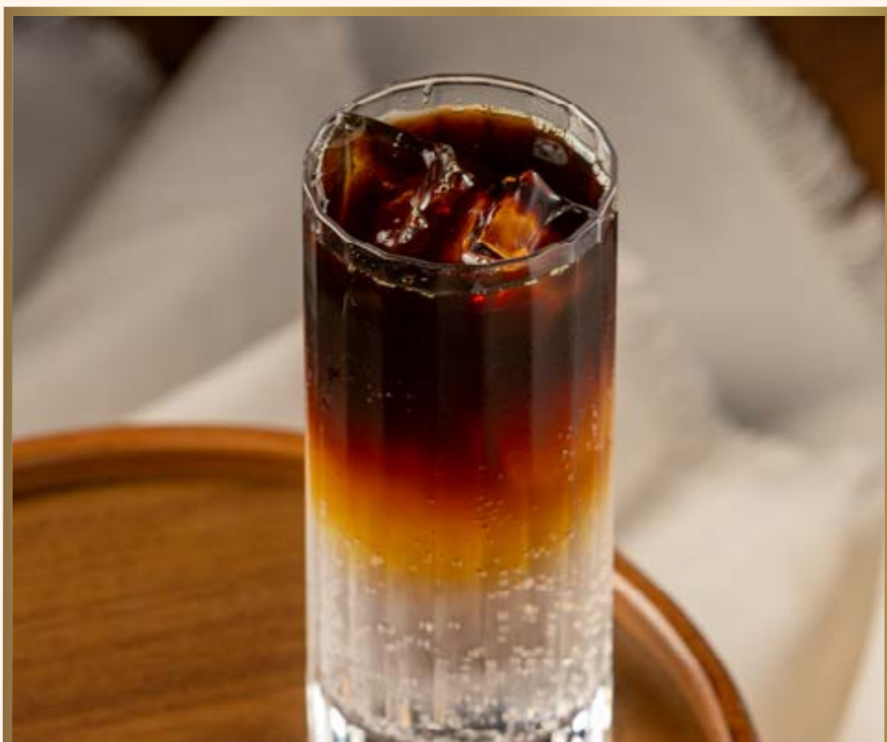
气泡意式浓缩咖啡 SPARKLING ESPRESSO