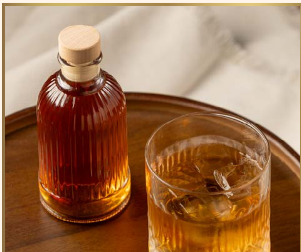
冷泡茶 (每天精选) COLD BREW TEA (DAILY SPECIAL)