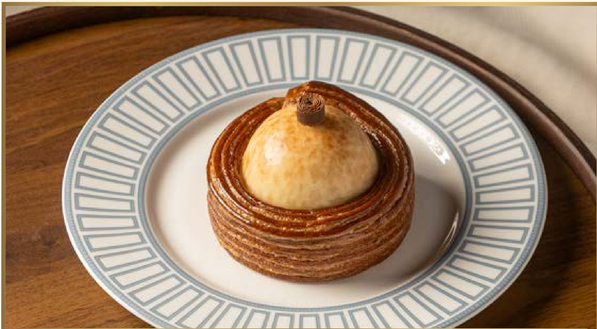
提拉米苏丹麦酥 TIRAMISU DANISH