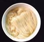
龙须拉面 Dragon Beard La Mian