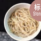
标准 Standard 翡翠拉面 Crystal Jade La Mian

本店备有三款不同手工拉面供选择 3 varieties of La Mian for your selection