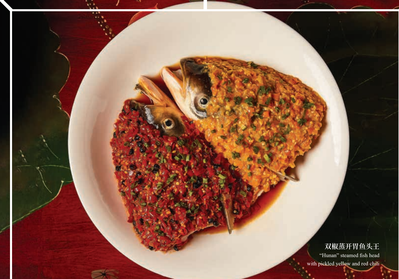
双椒蒸开胃鱼头王 “Hunan” steamed fish head with pickled yellow and red chili