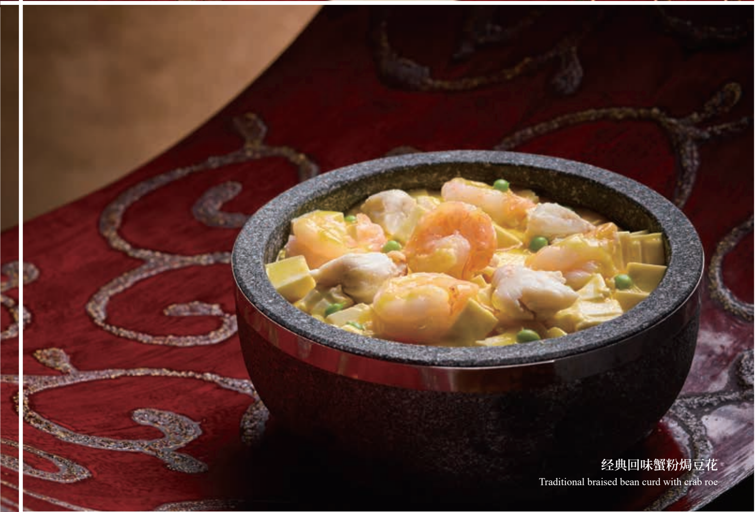
经典回味蟹粉焗豆花 Traditional braised bean curd with crab roe