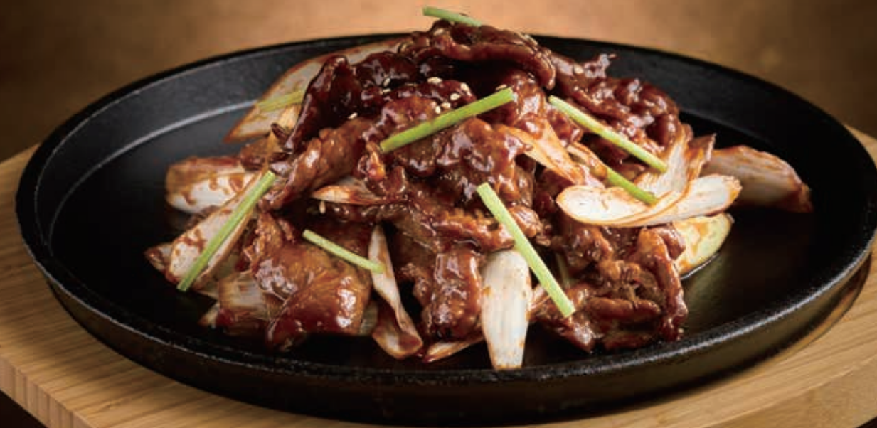
京城葱爆牛肩肉 Stir-fried beef shoulder with onions