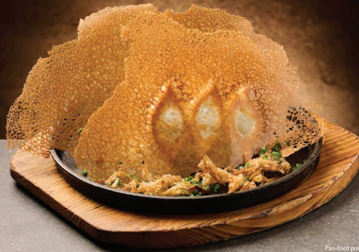
鮮肉鍋貼 Pan-fried pork dumplings

尊享獎賞！請向我們的餐飲服務員查詢金沙會餐飲優惠。 Be Rewarded! Ask your server about Sands Rewards dining benefits.