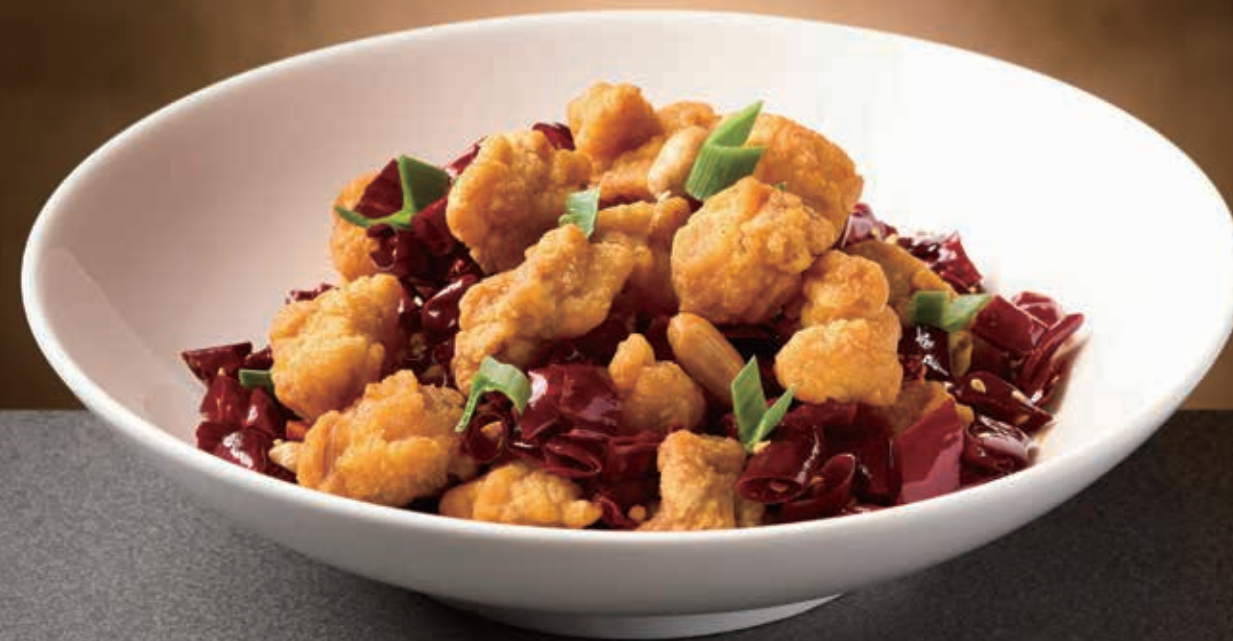
重庆无骨辣子鸡 “Chongqing” deep-fried boneless chicken with dried chili and peanuts

所有价格以澳门元计算，并须另加10%服务费。 All prices are in MOP and subject to 10% service charge. 如果您对食物过敏，请在下单时告知服务员。 Please inform our server of any food allergies prior to ordering. 尊享奖赏！请向我们的餐饮服务员工查询金沙会餐饮优惠。 Be Rewarded! Ask your server about Sands Rewards dining benefits.