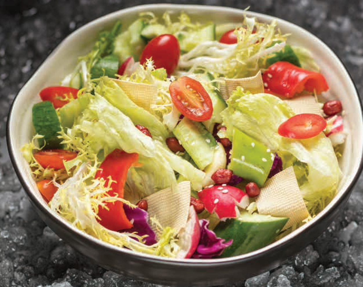
北方大拌菜 Northern Chinese mixed vegetables salad with peanuts

所有价格以澳门元计算，并须另加10%服务费。 All prices are in MOP and subject to 10% service charge. 如果您对食物过敏，请在下单时告知服务员。 Please inform our server of any food allergies prior to ordering. 尊享奖赏！请向我们的餐饮服务人员查询金沙会餐饮优惠。 Be Rewarded! Ask your server about Sands Rewards dining benefits.