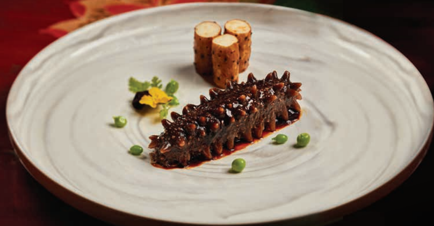
铁棍山药烧海参 Braised sea cucumber with yam in leek sauce

所有价格以澳门元计算，并须另加10%服务费。 All prices are in MOP and subject to 10% service charge. 如果您对食物过敏，请在下单时告知服务员。 Please inform our server of any food allergies prior to ordering. 尊享奖赏！请向我们的餐饮服务员工查询金沙会餐饮优惠。 Be Rewarded! Ask your server about Sands Rewards dining benefits.