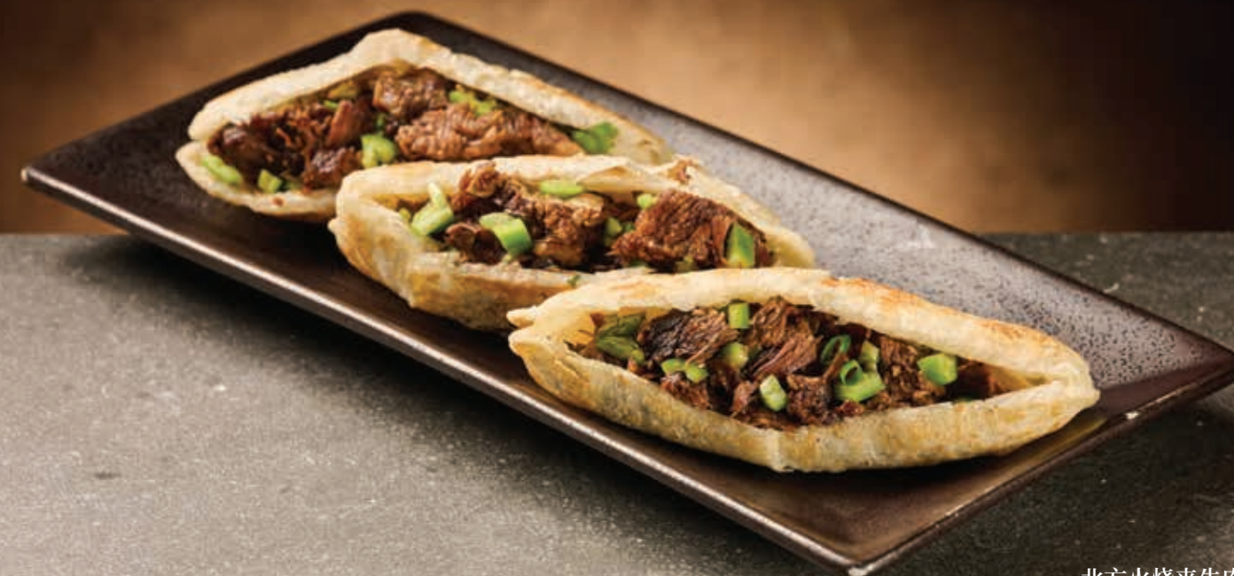
北方火燒夾牛肉 “Northern” braised beef in crispy pastry pockets