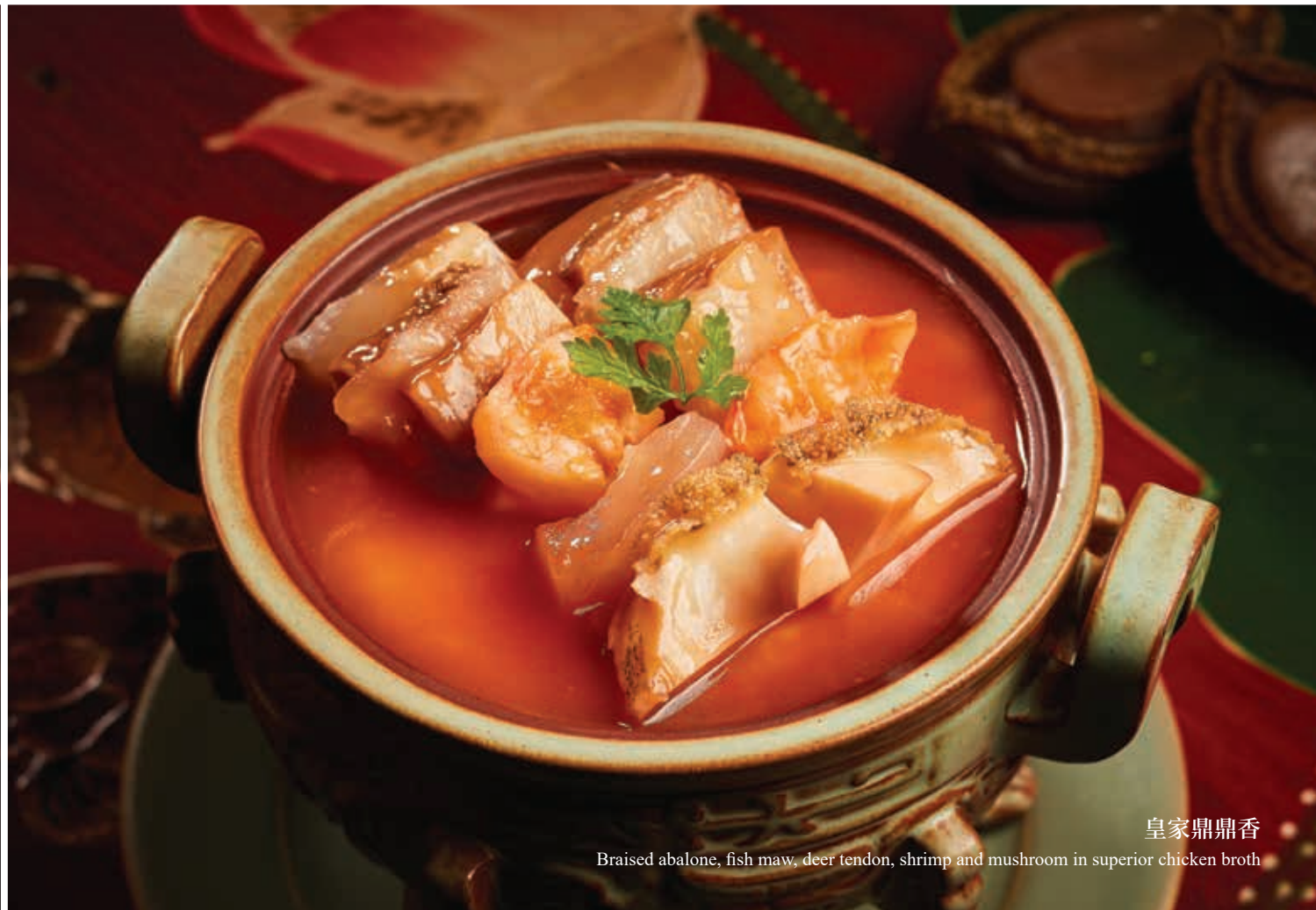
皇家鼎鼎香 Braised abalone, fish maw, deer tendon, shrimp and mushroom in superior chicken broth